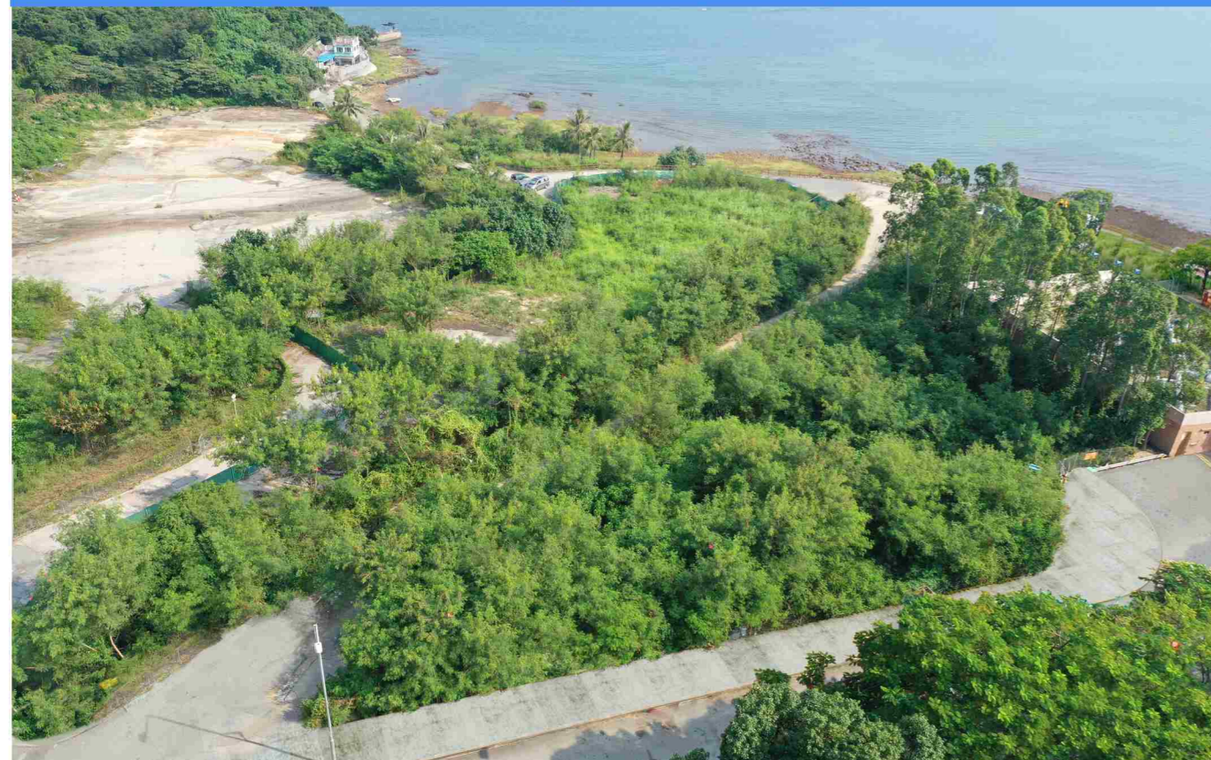
10 Years with Mitigation Measure