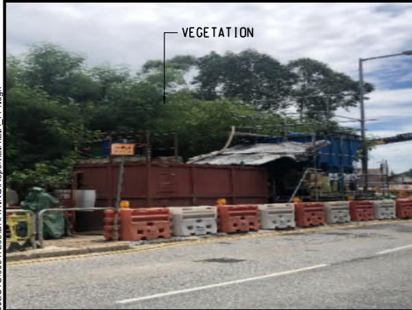
PHOTO 3932 VEGETATION IN SOUTHERN PORTION OF THE PROJECT SITE DATE TAKEN: 23 JULY 2020