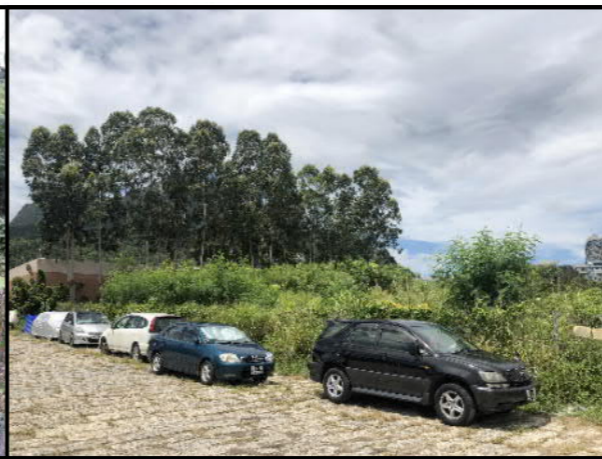
PHOTO 3916 VEGETATED LAND IN EASTERN PORTION OF THE PROJECT SITE DATE TAKEN: 23 JULY 2020