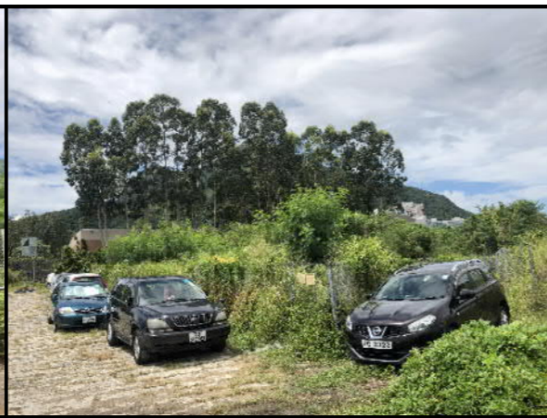
PHOTO 3915 VEGETATED LAND IN NORTHERN PORTION OF THE PROJECT SITE DATE TAKEN: 23 JULY 2020