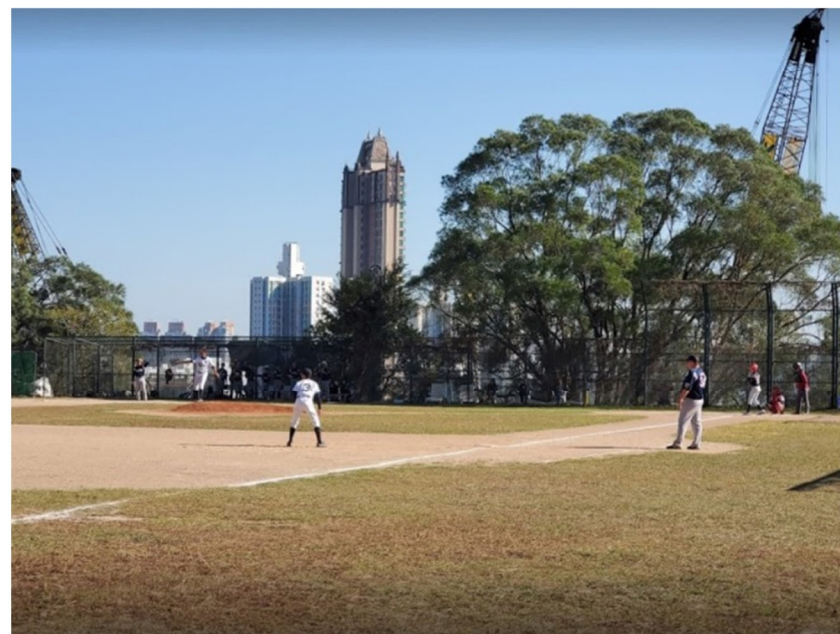
LR3.22 LION ROCK PARK BASEBALL FIELD