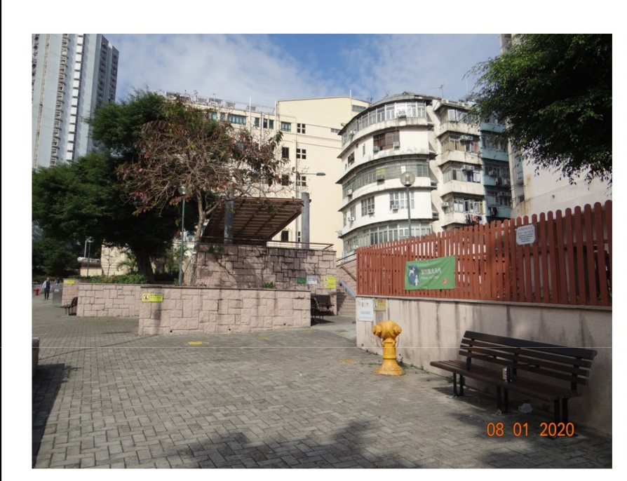
LR3.24 FEI FUNG STREET SITTING-OUT AREA