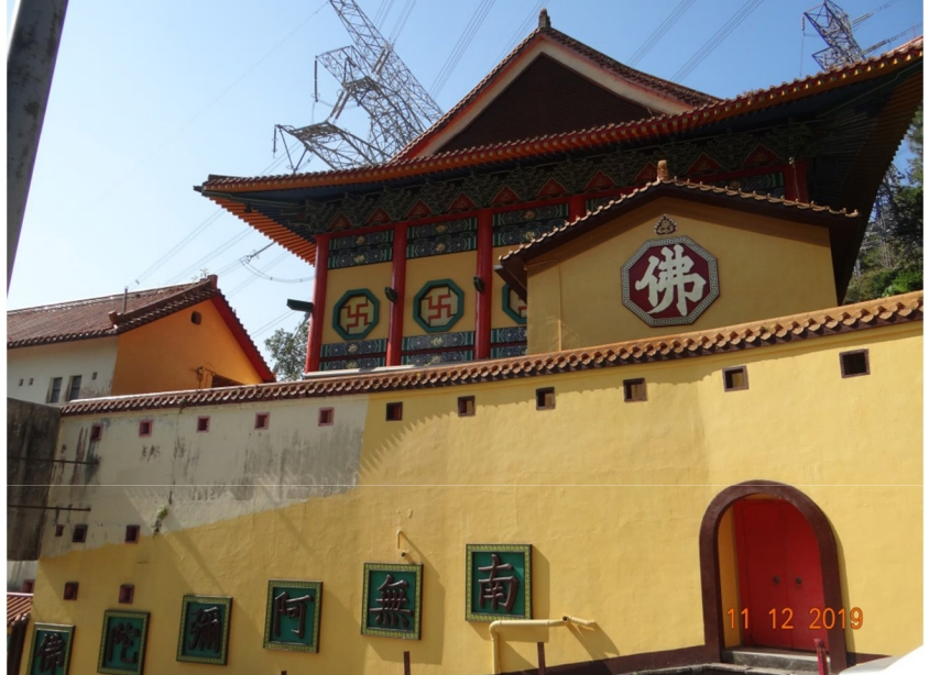
LR3.25 FAT JONG TEMPLE