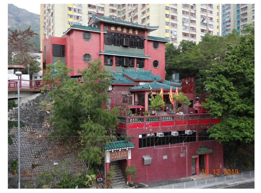
LR3.26 CHIU CHOW PO HING LIN FAT SHE