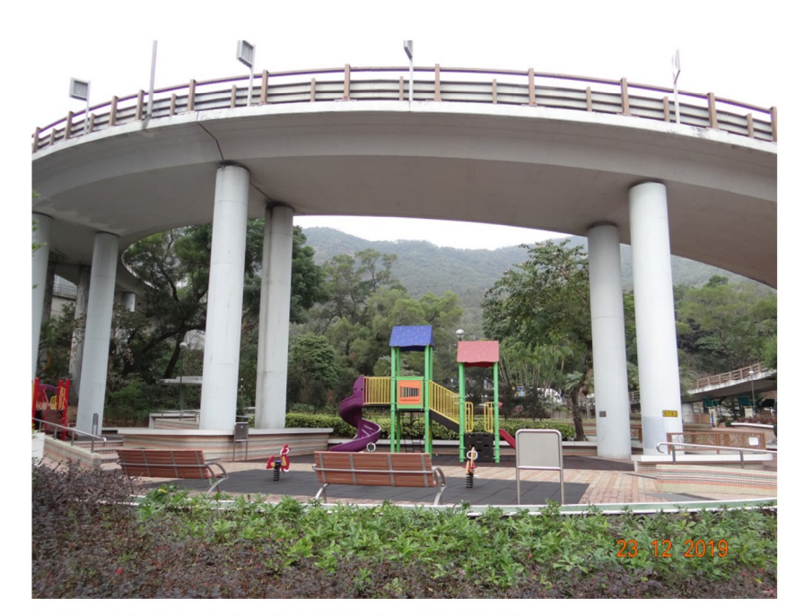
LR3.21 BROADCAST DRIVE GARDEN