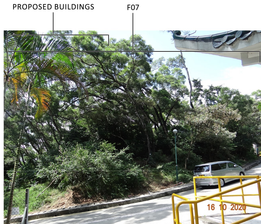
VSR-11 OCCUPANTS IN LION ROCK PARK TRANSIT NURSERY