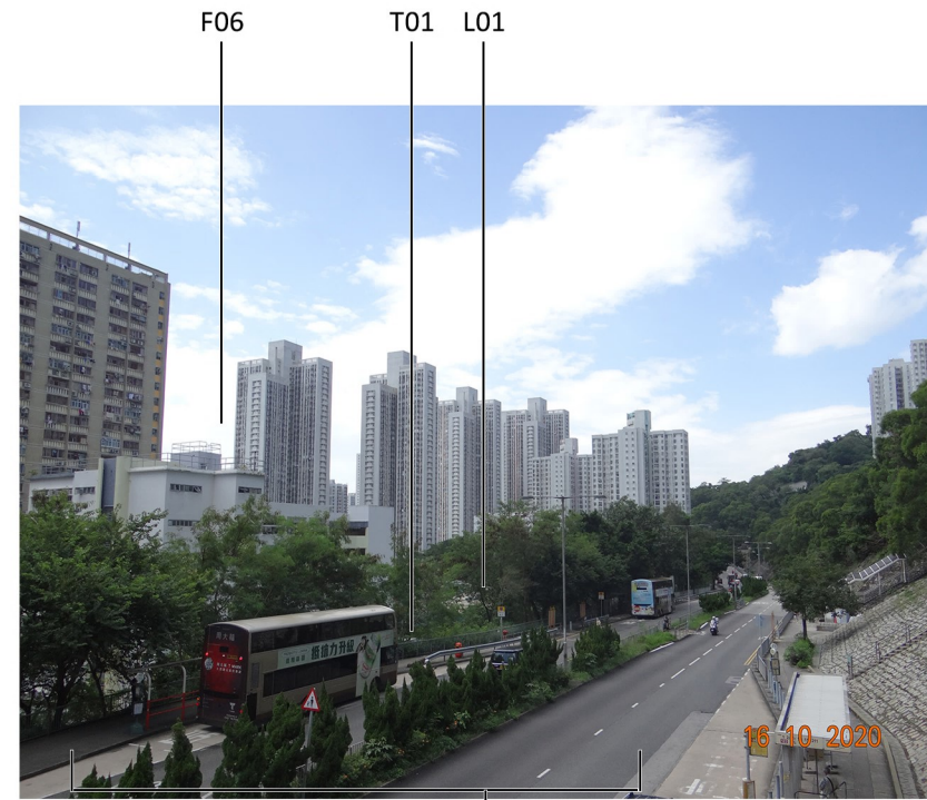
PROJECT SITE VSR-9 RESIDENTS IN TIN MA COURT & OCCUPANTS IN RAINBOW PRIMARY SCHOOL