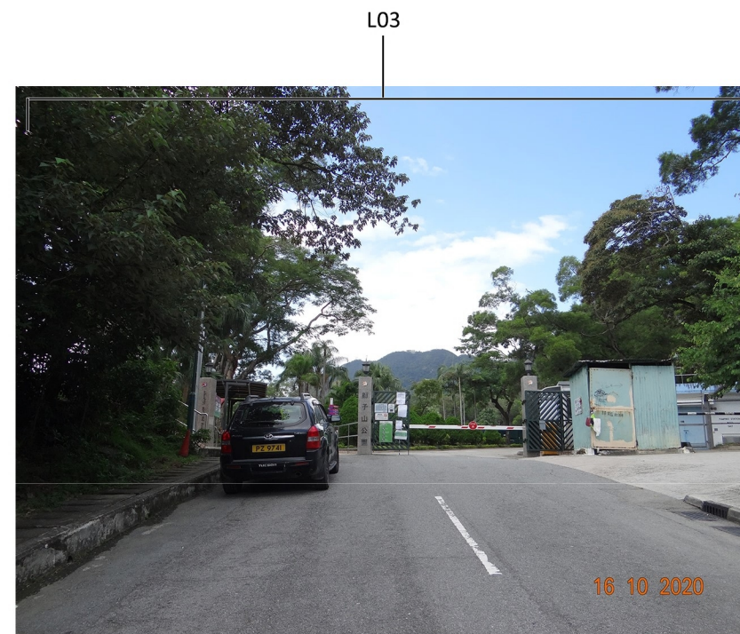
VSR-12 RECREATIONAL USERS IN LION ROCK PARK