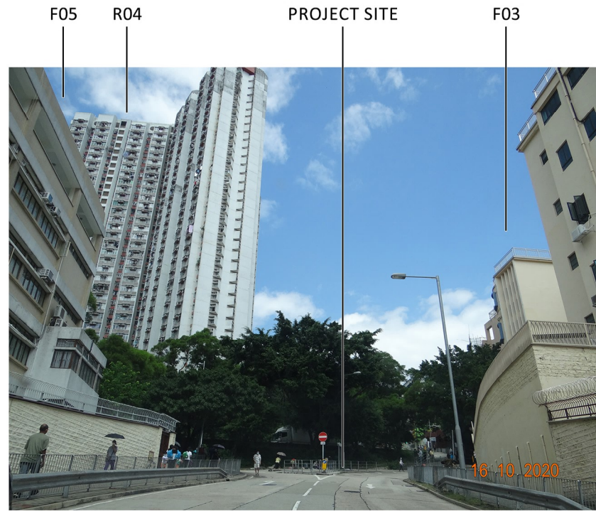
VSR-7 OCCUPANTS IN DAUGHTER OF MARY HELP OF CHRISTIANS - SALESIAN SISTERS AND OUR LADY'S KINDERGARTEN