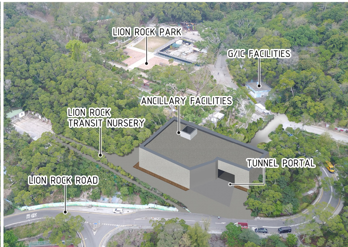
DAY 1 OPERATION PHASE WITHOUT LANDSCAPE AND VISUAL MITIGATION MEASURES