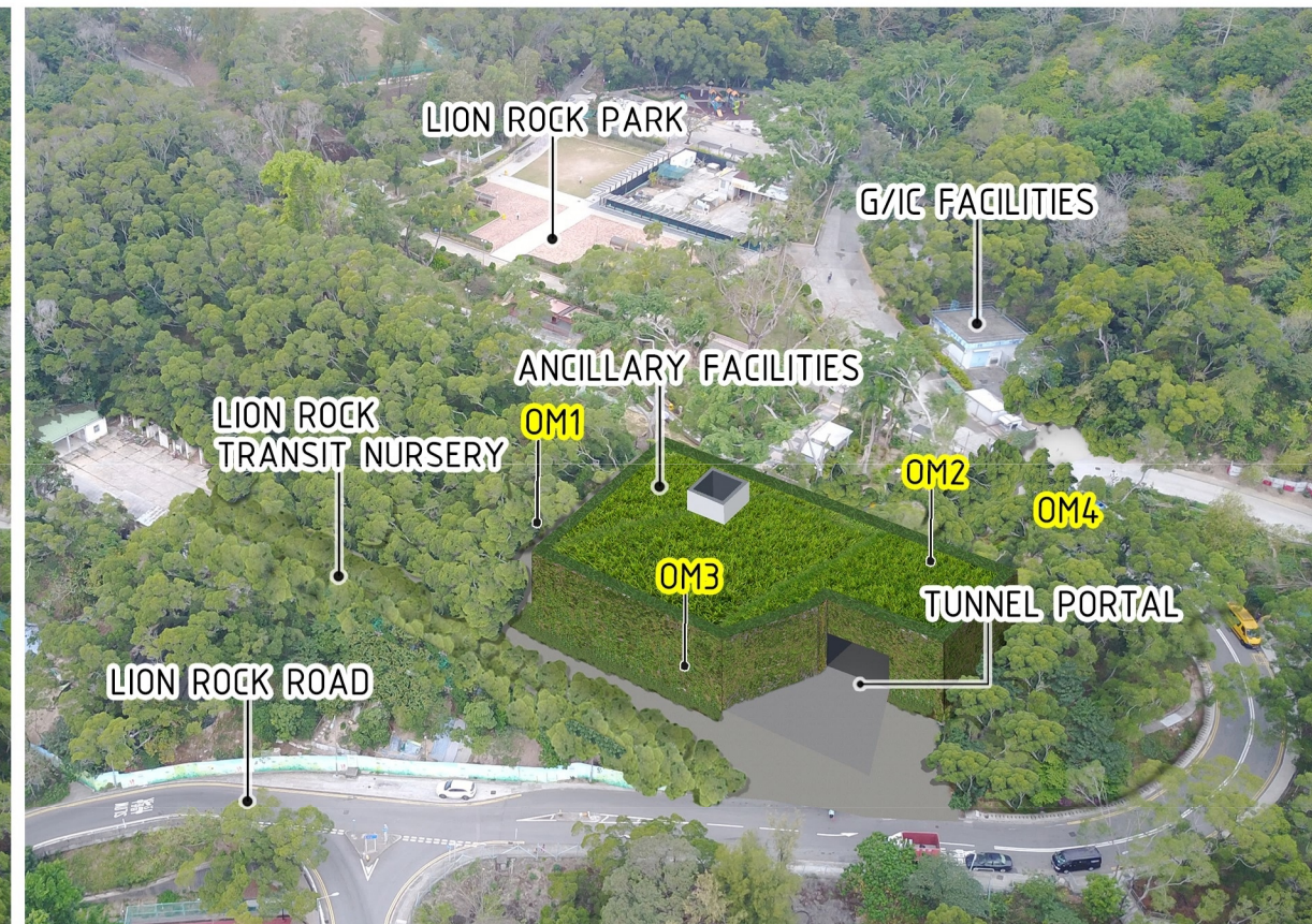
YEAR 10 OPERATION PHASE WITH LANDSCAPE AND VISUAL MITIGATION MEASURES