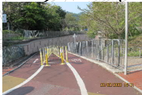
PHOTO 2821: CYCLING TRACK AND VEGETATION (DATE TAKEN: 20 FEBRUARY 2020)