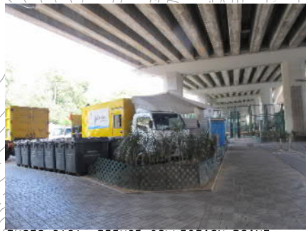
PHOTO 8181: REFUSE COLLECTION POINT (DATE TAKEN: 20 FEBRUARY 2020)