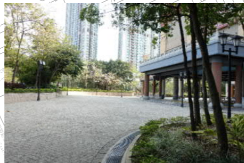
PHOTO 1840: OPEN AREA OUTSIDE OF HONG KONG HERITAGE MUSEUM (DATE TAKEN: 20 FEBRUARY 2020)