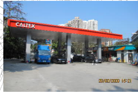
PHOTO 2806: PETROL FILLING STATION (DATE TAKEN: 20 FEBRUARY 2020)