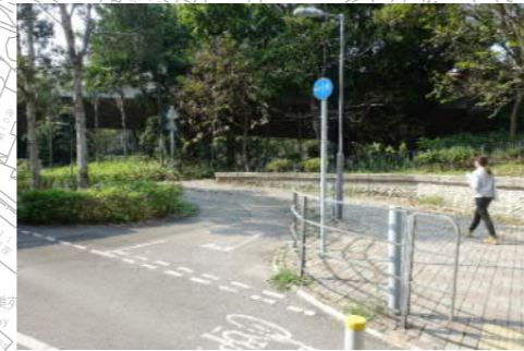
PHOTO 1800: CYCLING TRACK AND VEGETATION (DATE TAKEN: 20 FEBRUARY 2020)