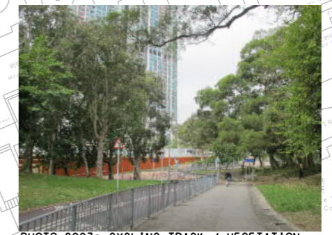
PHOTO 8293: CYCLING TRACK / VEGETATION (DATE TAKEN: 25 FEBRUARY 2020)