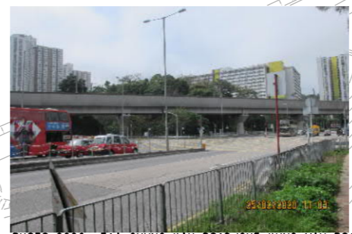
PHOTO 2896: TAI CHUNG KIU ROAD/CHE KUNG MIU ROAD (DATE TAKEN: 25 FEBRUARY 2020)