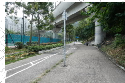
PHOTO 1927: FOOTPATH AND CYCLING TRACK (DATE TAKEN: 25 FEBRUARY 2020)