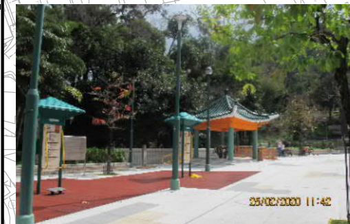
PHOTO 2931: SHA TIN TAU VILLAGE SITTING-OUT AREA (DATE TAKEN: 25 FEBRUARY 2020)