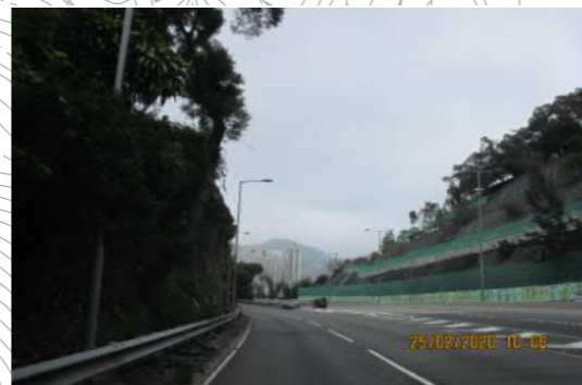
PHOTO 2845: SHA TIN ROAD / VEGETATION (DATE TAKEN: 25 FEBRUARY 2020)