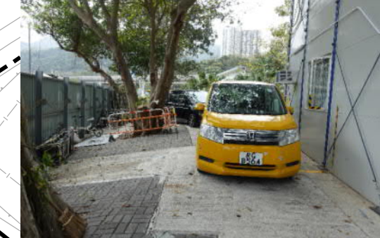
PHOTO 1909: CEDD'S SITE OFFICE - CAR PARK (DATE TAKEN: 25 FEBRUARY 2020)