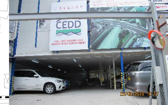
PHOTO 2893: ENTRANCE OF CEDD'S SITE OFFICE / CAR PARK (DATE TAKEN: 25 FEBRUARY 2020)