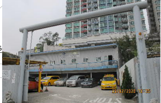
PHOTO 2873: ENTRANCE OF HYD'S SITE OFFICE / CAR PARK (DATE TAKEN: 25 FEBRUARY 2020)