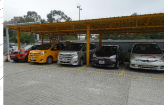
PHOTO 1854: HYD'S SITE OFFICE - CAR PARK (DATE TAKEN: 25 FEBRUARY 2020)