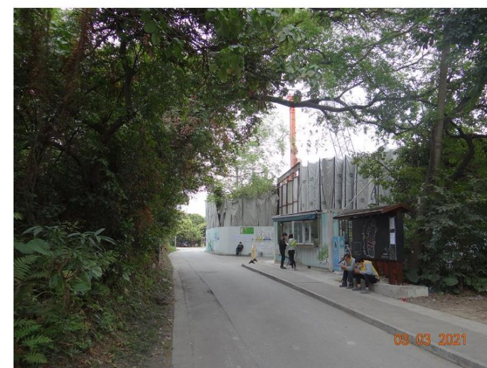
LR3-1-2: Planting Surrounding Developed Area (PSFSC)