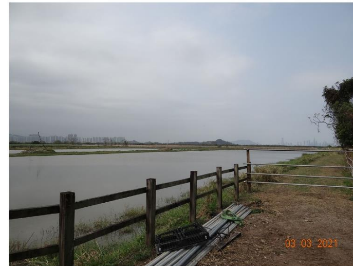
LR2-2: Rain-fed Pond