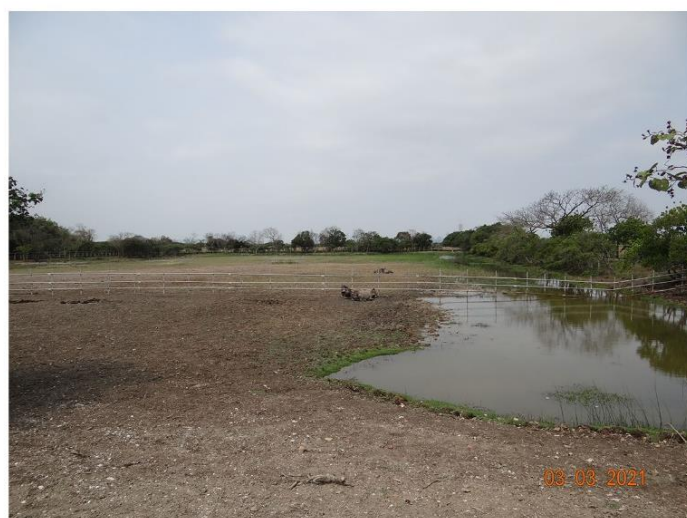
LR2-6: Buffalo Marsh