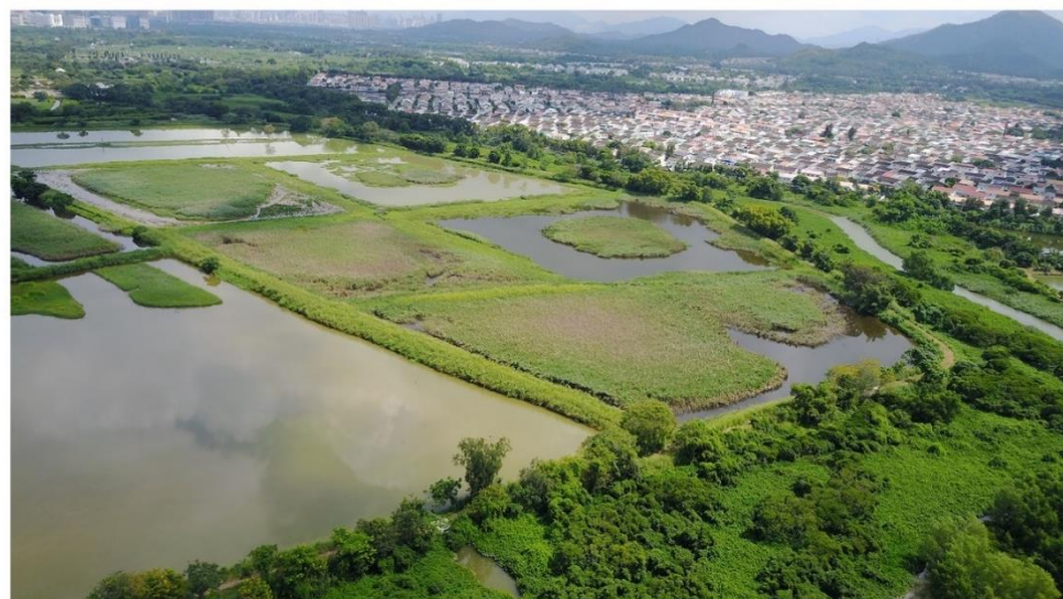
LR2-2 Rain-fed Pond