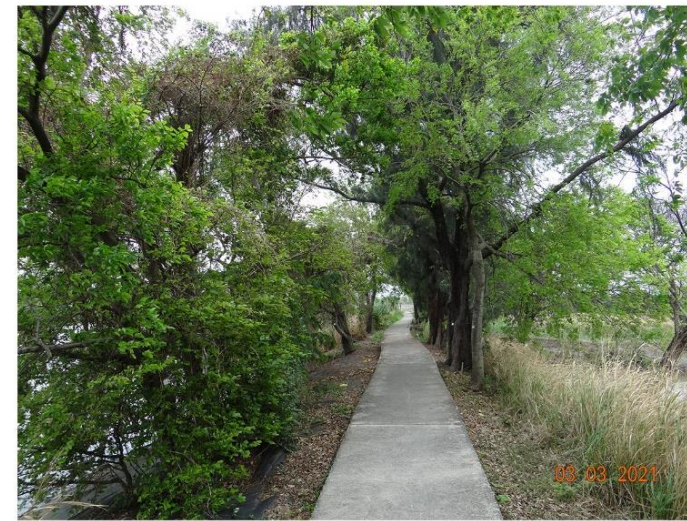
LR1-3: Wooded Area