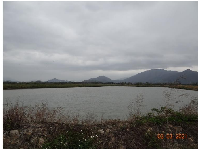
LR2-1: Brackish Gei Wai