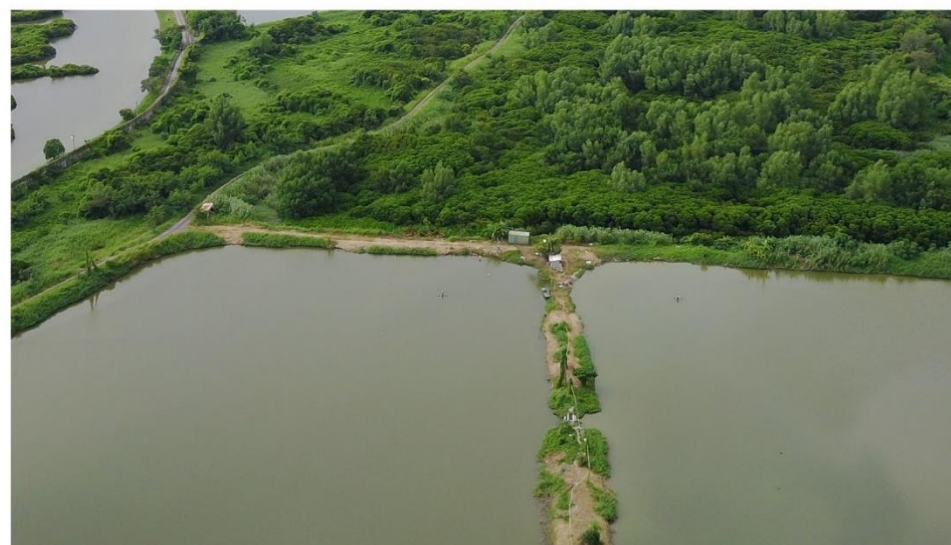
LR2-1 Brackish Gei Wai