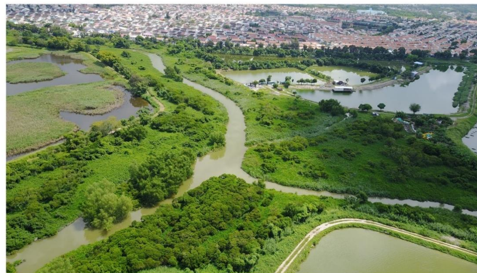
LR1-2 Brackish Marsh