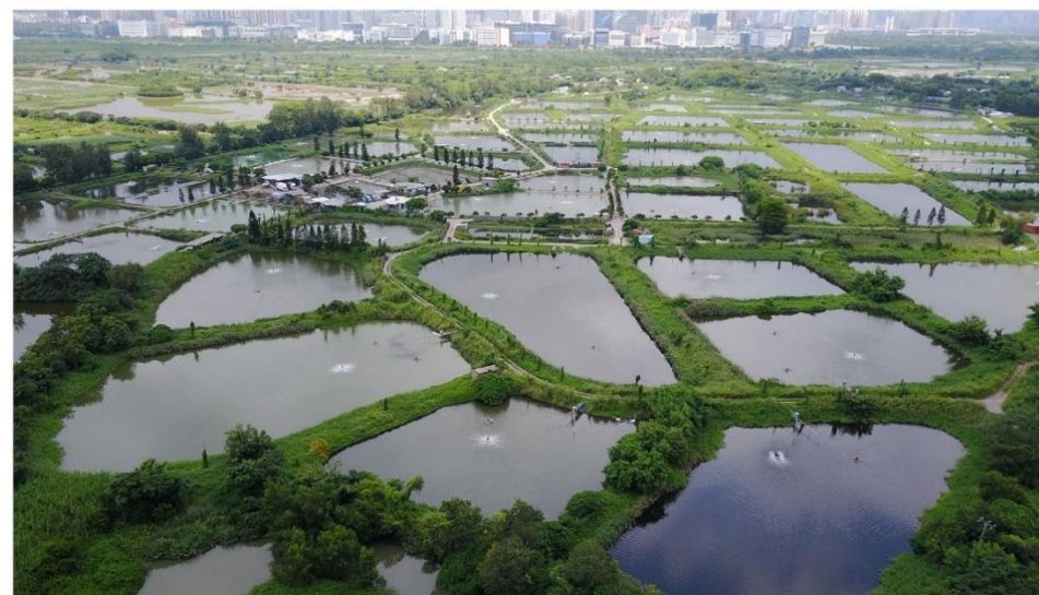
LR2-3 Commercial Fishpond