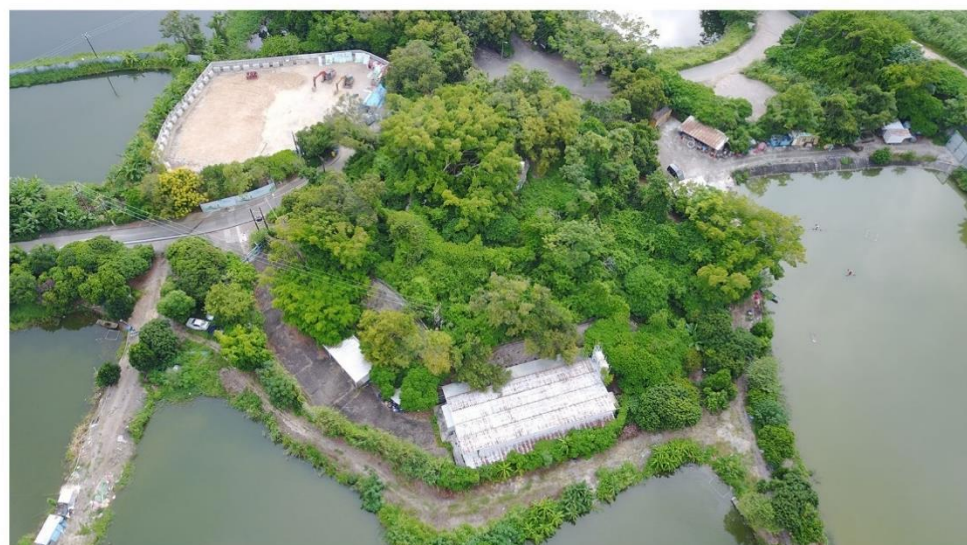
LR1-3 Wooded Area