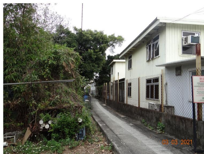
LR3-1-1: Planting Surrounding Developed Area