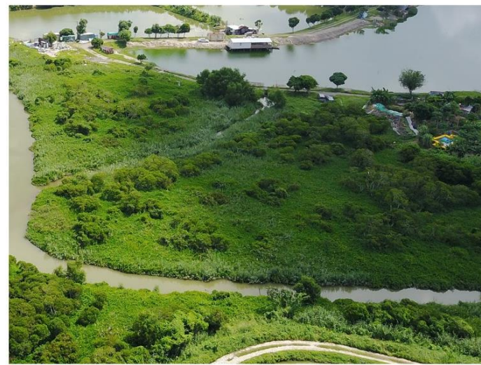
LR1-2: Brackish Marsh