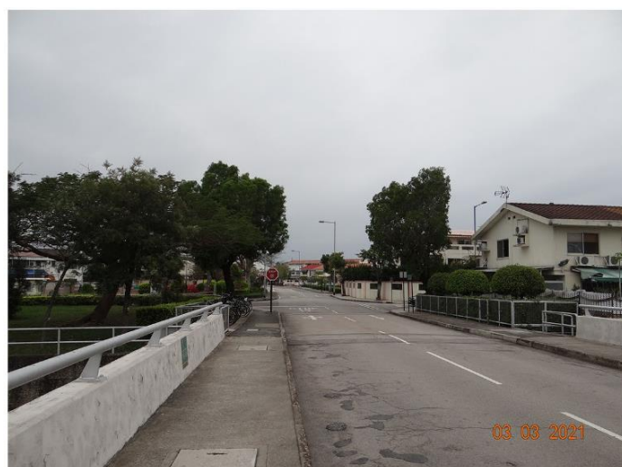
LR3-1-3: Planting Surrounding Developed Area (Fairview Park)