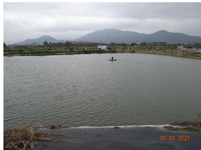
LR2-3: Commercial Fishpond