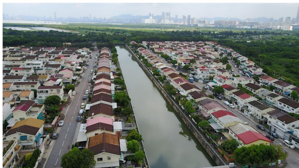
LR2-4 Channelised Watercourse