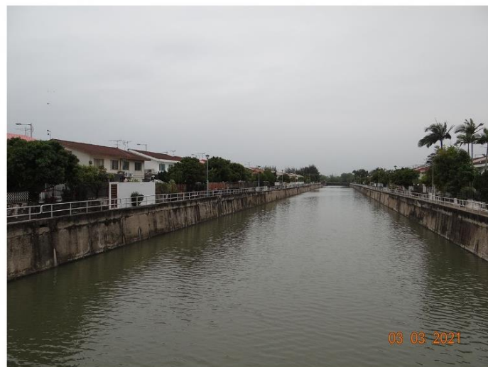
LR2-4: Channelised Watercourse