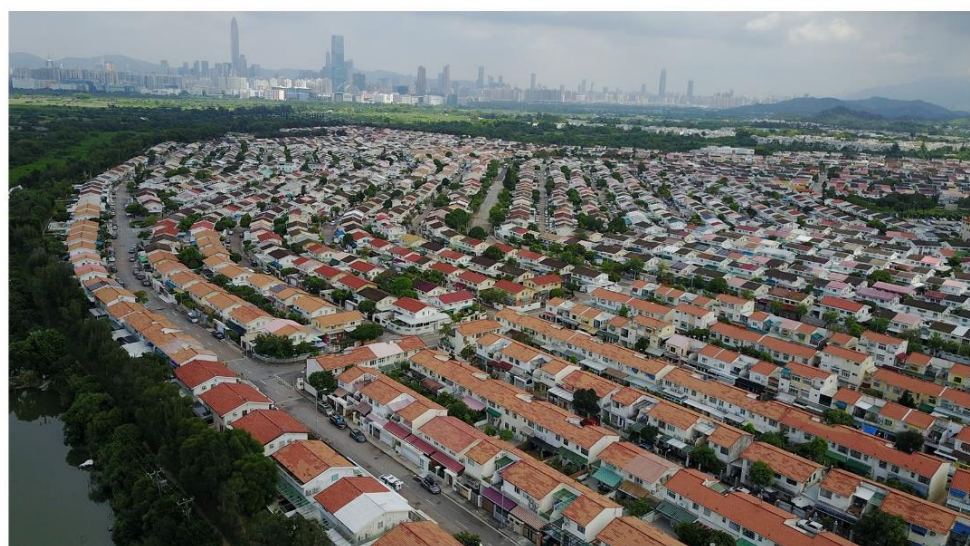
LR3-1 – Planting surrounding Development Area