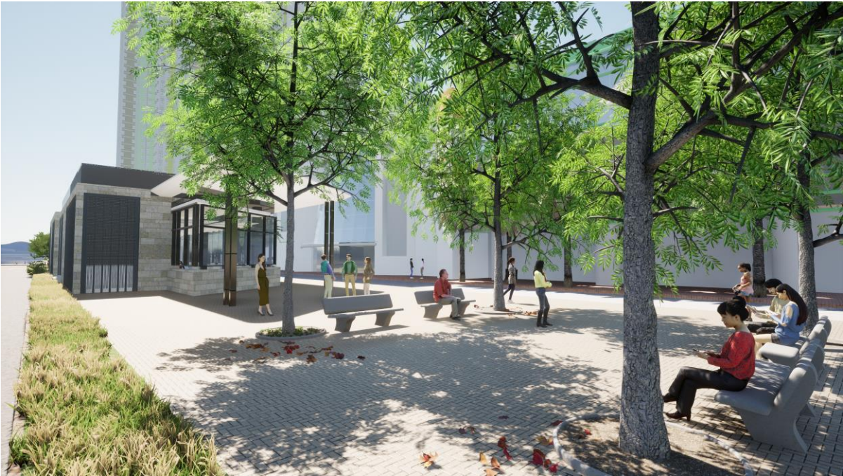
TCW Station Entrance B