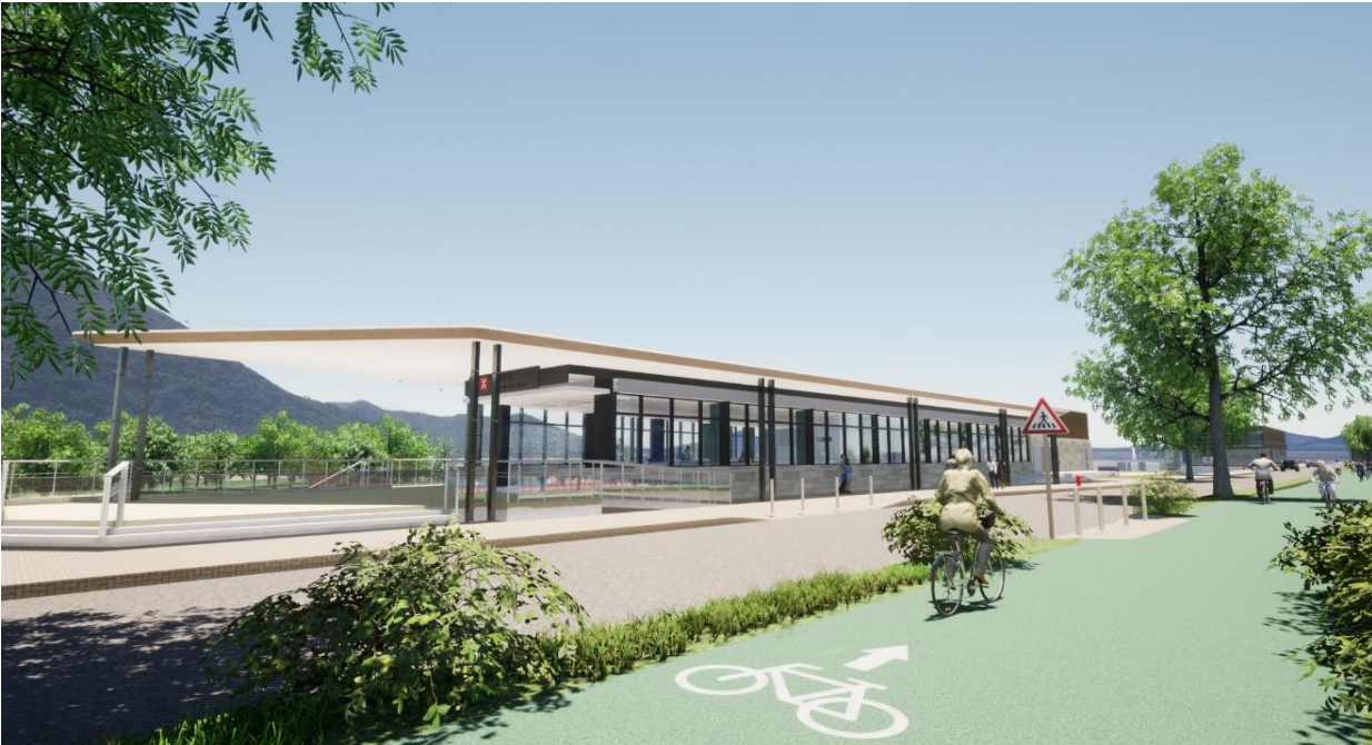
TCW Station Entrance A