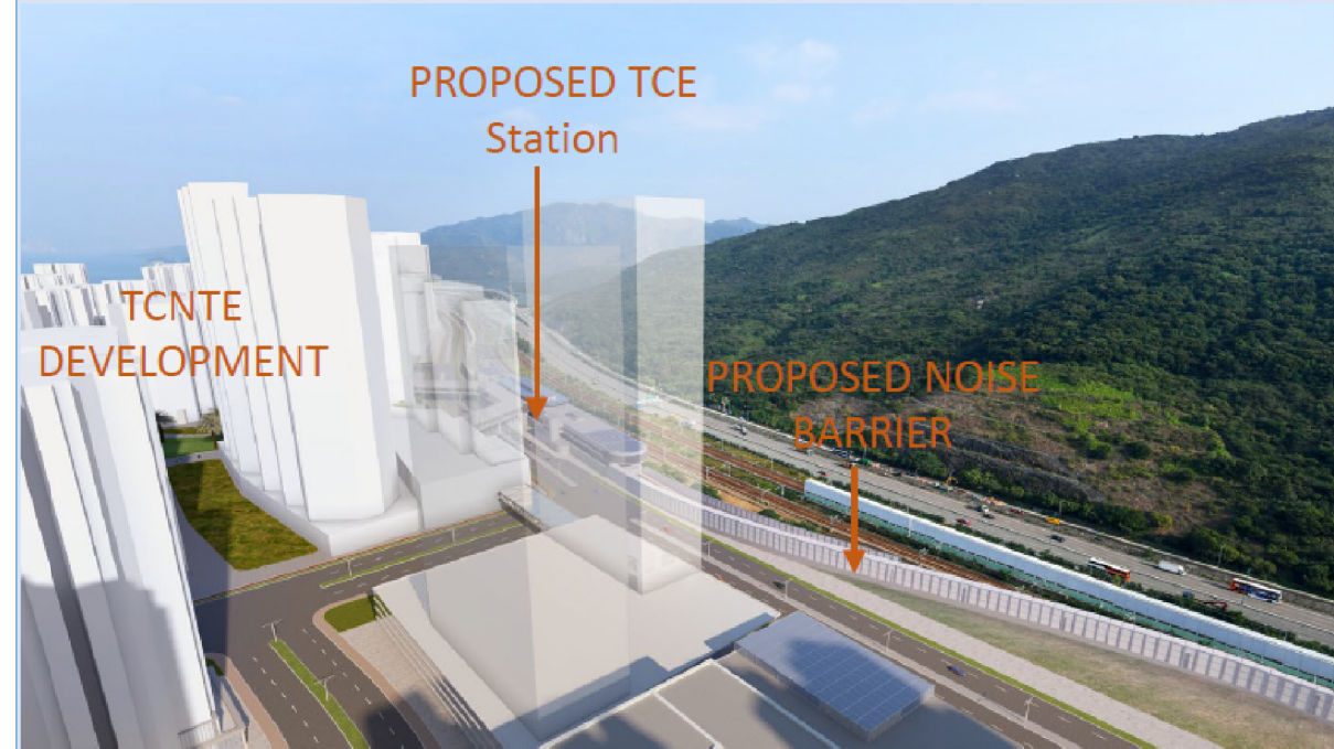
Day 1 without Mitigation Measures