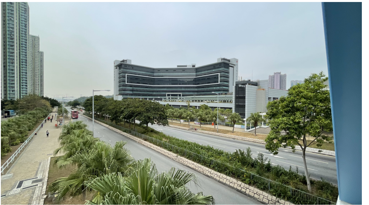
LCA12 INSTITUTIONAL LANDSCAPE