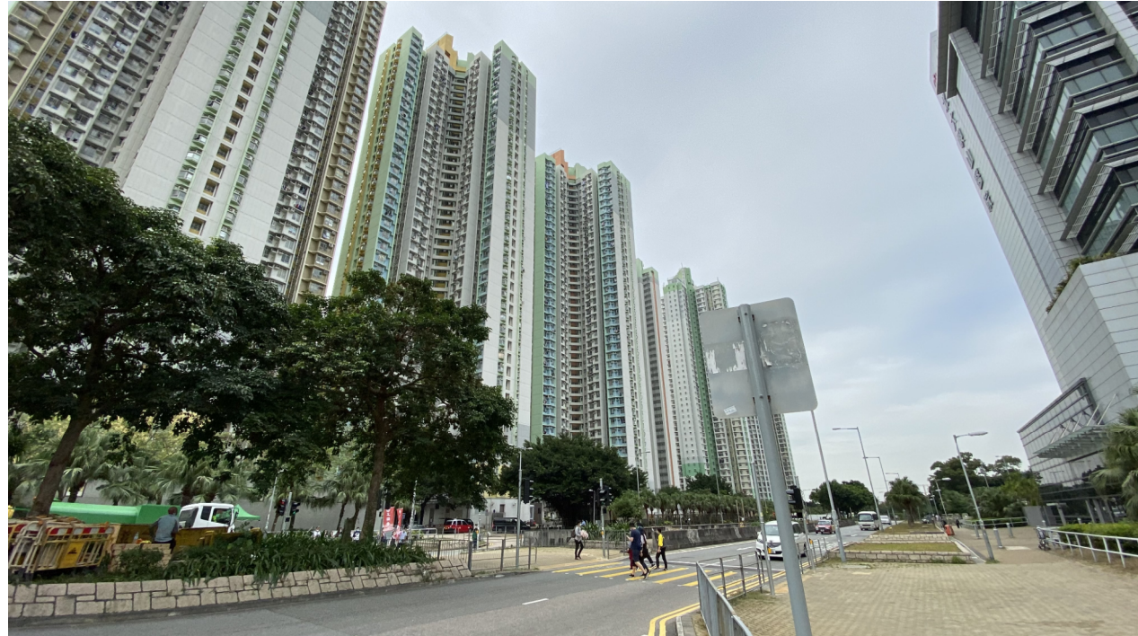
LCA13 RESIDENTIAL URBAN LANDSCAPE