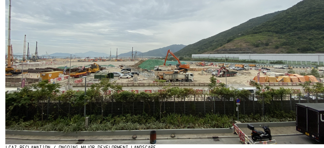
LCA7 RECLAMATION / ONGOING MAJOR DEVELOPMENT LANDSCAPE