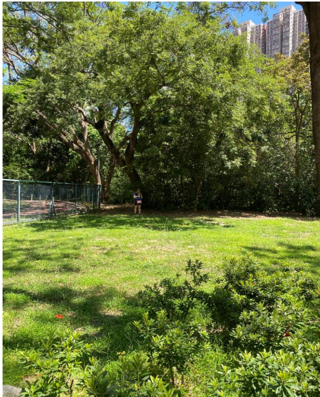
Photo 10.5. Archaeological Potential Area at Wu Shan Recreation Playground-1