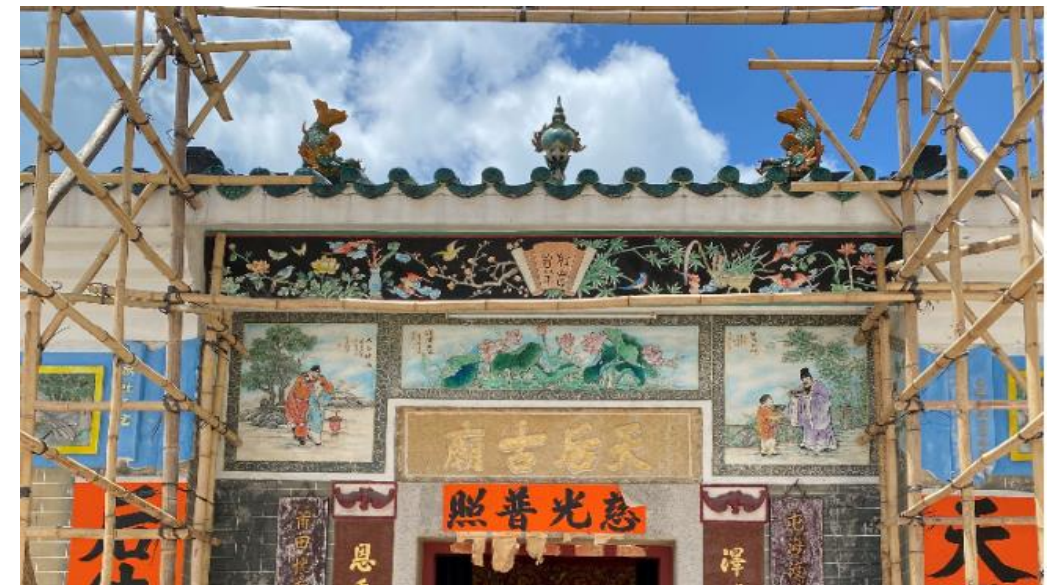
Photo 10.4. Fascia Board of Flowers and Auspicious Treasures Carving Under the Eave of Hau Kok Tin Hau Temple