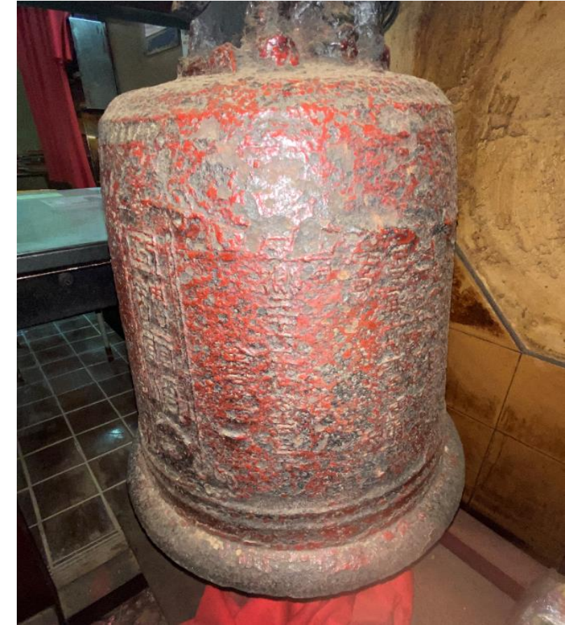
Photo 10.3. Bell of Hau Kok Tin Hau Temple