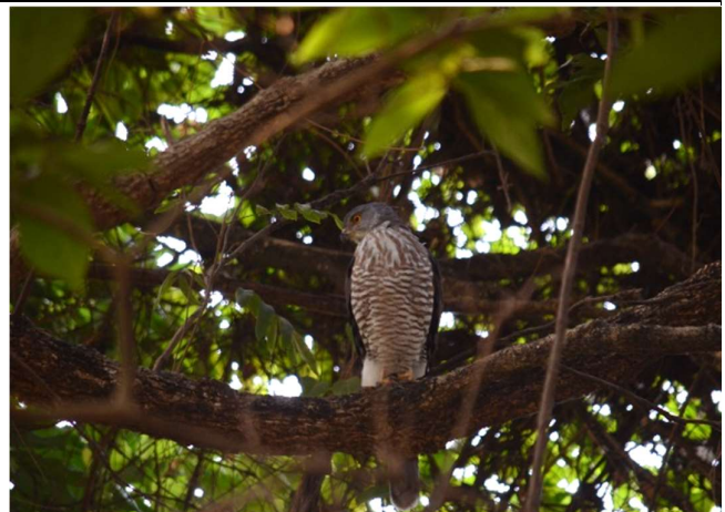
Crested Goshawk ( Accipiter trivirgatus )