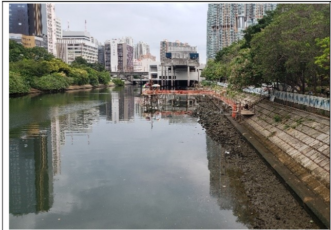
Modified Watercourse (within Project Boundary)