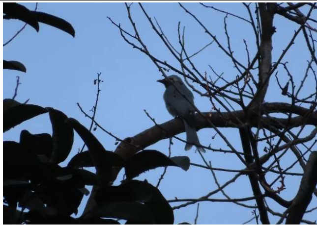
Ashy Drongo ( Dicrurus leucophaeus )