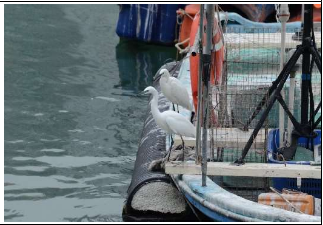
Little Egret ( Egretta garzetta )