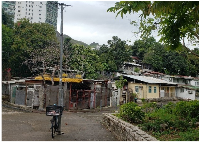
Village / Orchard