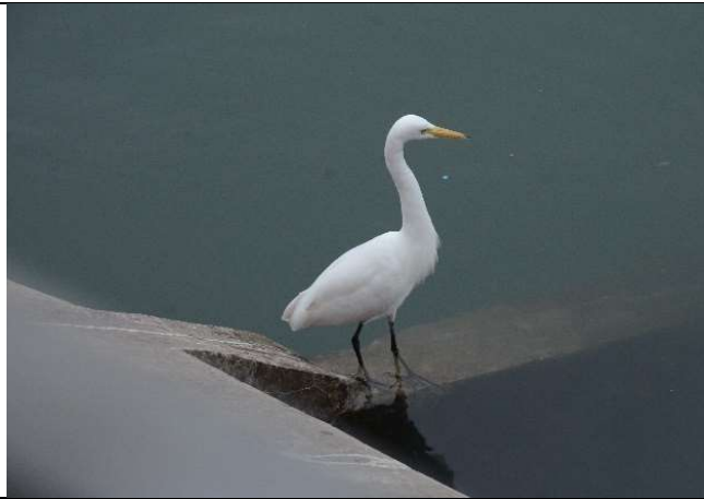
Intermediate Egret ( Egretta intermedia )