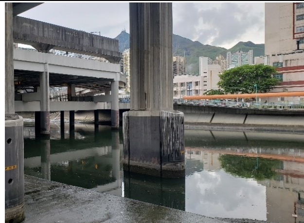
Modified Watercourse (Upstream)