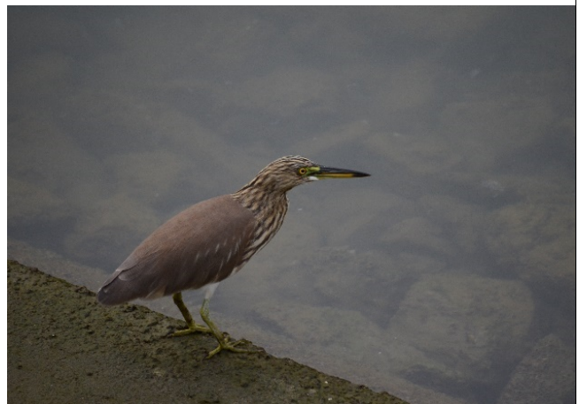
Chinese Pond Heron ( Ardeola bacchus )