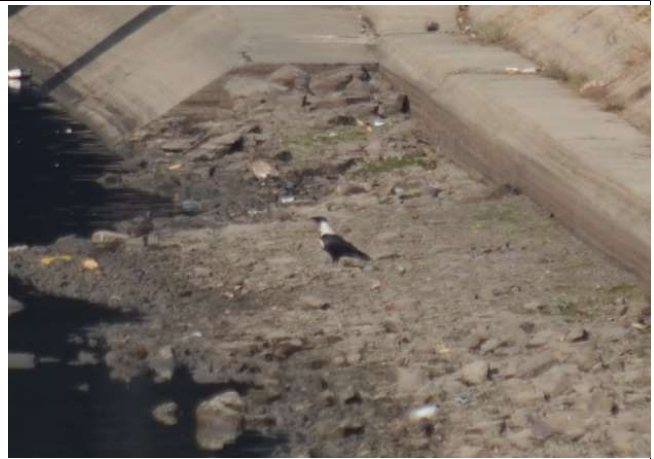
Collared Crow ( Corvus torquatus )