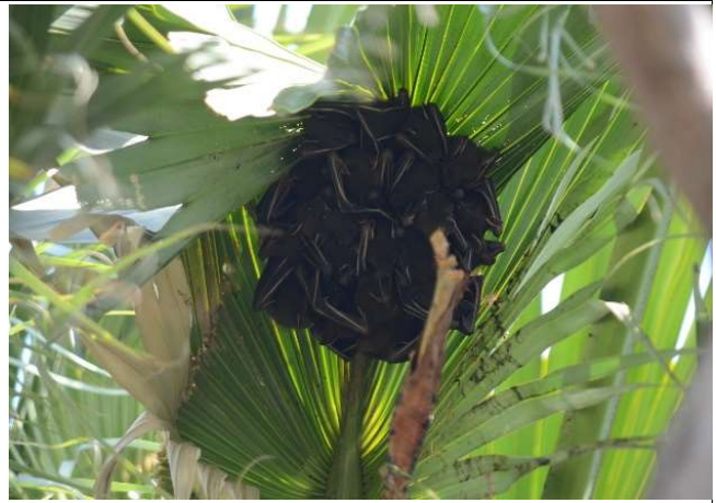
Short-nosed Fruit Bat ( Cynopterus sphinx )