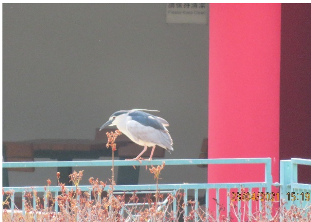
Black-crowned Night Heron ( Nycticorax nycticorax )