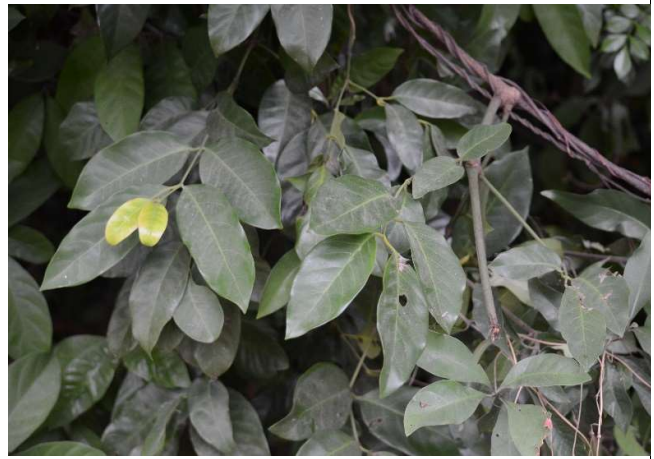
Luofushan Joint-Fir ( Gnetum luofuense )