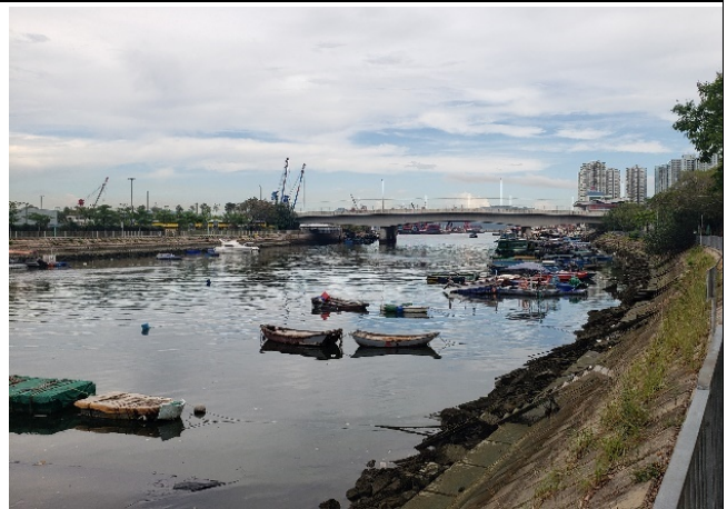
Modified Watercourse (Downstream)