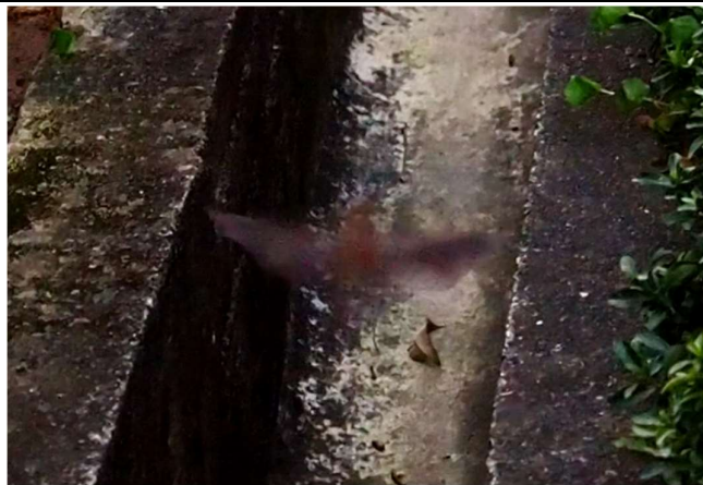
Least Horseshoe Bat ( Rhinolophus pusillus )