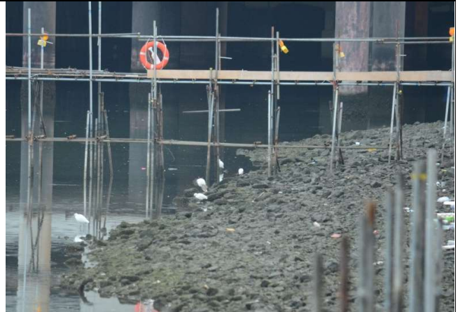
Ardeids utilising TMRC adjacent to existing works