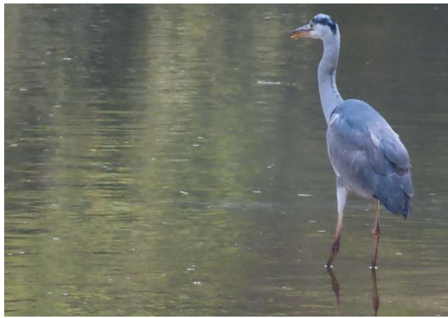
Grey Heron ( Ardea cinerea )