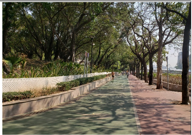
Developed Area (within Project Boundary)