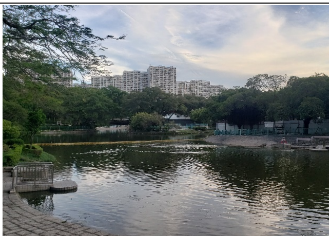
Developed Area (Urban Parks)