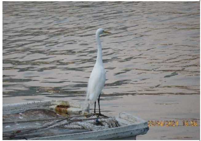
Great Egret ( Ardea alba )