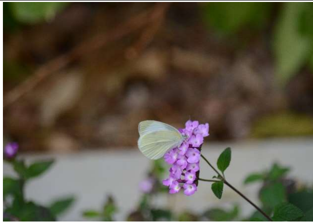
Small Cabbage White ( Pieris rapae crucivora )