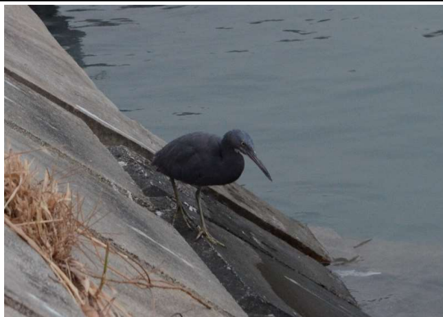
Pacific Reef Heron ( Egretta sacra )