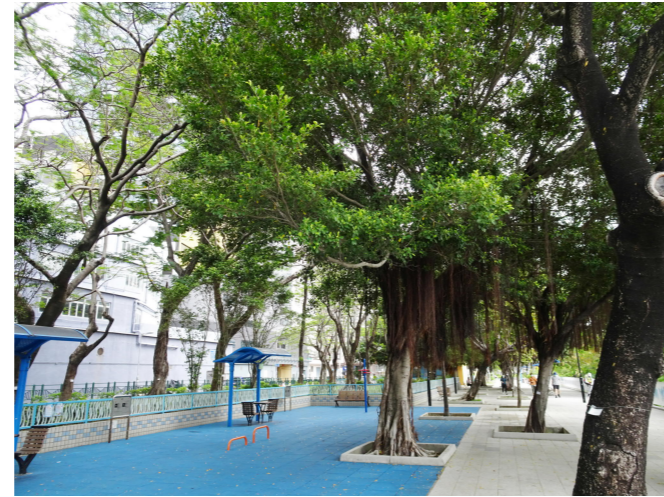
LR 1.2 - PUI TO ROAD (SOUTH) REST GARDEN