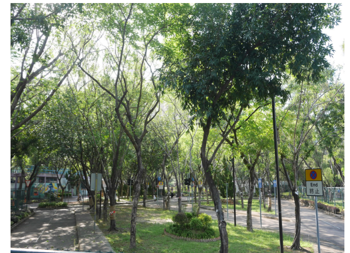
LR 1.8 - TUEN MUN ROAD SAFETY TOWN OF WU SHAN RECREATION PLAYGROUND