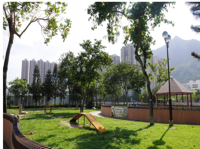
LR 1.5 - HOI WONG ROAD GARDEN & PET GARDEN