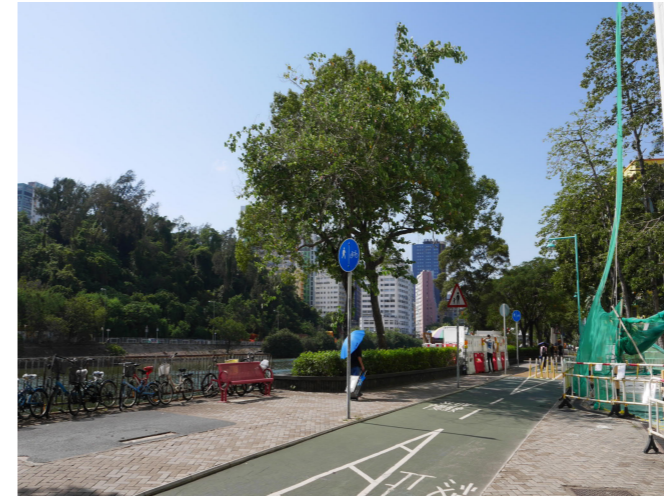
LR 1.3 - PROMENADE ALONG THE EASTERN BANK OF TUEN MUN RIVER CHANNEL