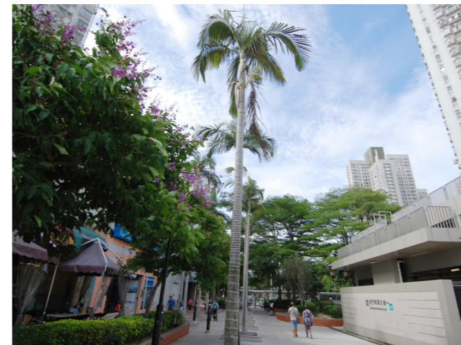
LR 1.10 - TUEN MUN PROMENADE