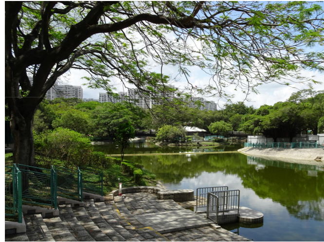
LR 1.1 - TUEN MUN PARK