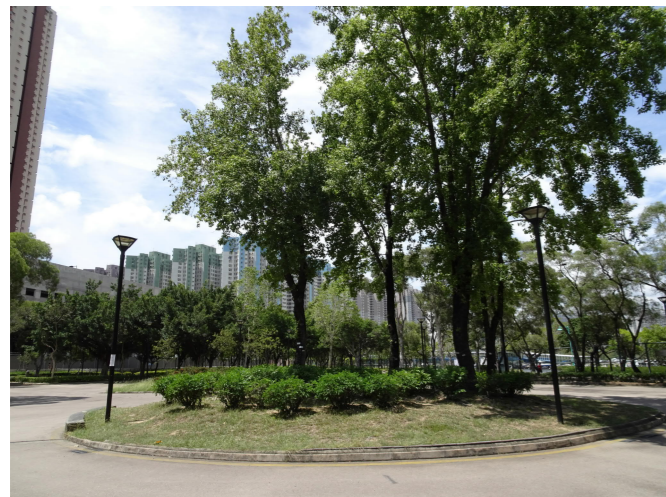
LR 1.8B - WU SHAN CYCLE PARK OF WU SHAN RECREATION PLAYGROUND