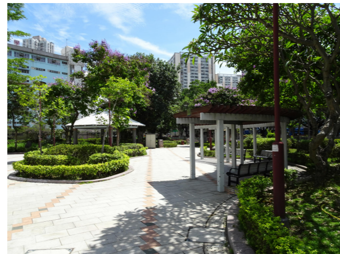
LR 1.9 - WU KING ROAD GARDEN