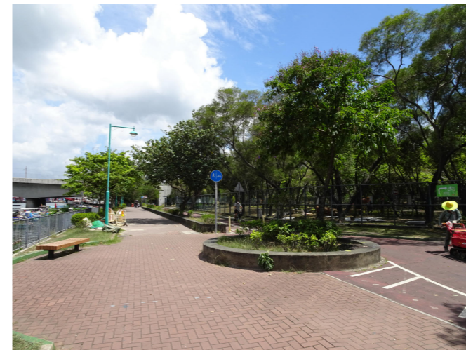
LR 1.7 - RIVERSIDE LANDSCAPE ADJACENT TO TUEN MUN ROAD SAFETY TOWN