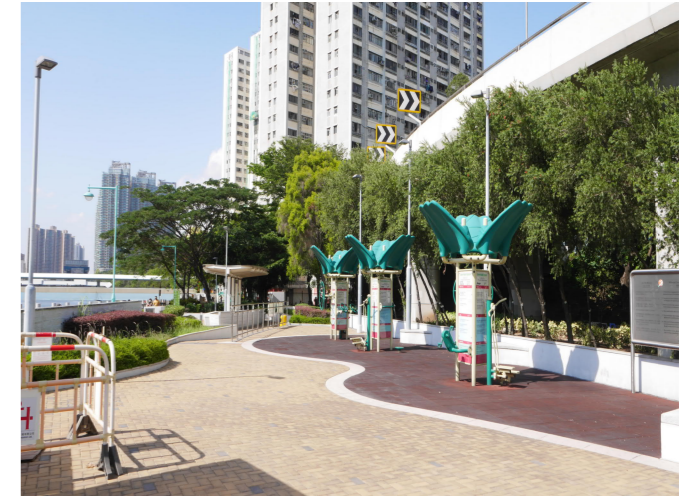
LR 1.4 - TUEN MUN RIVER (EASTERN BANK) GARDEN