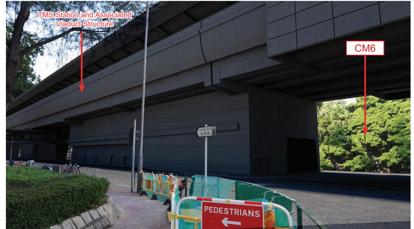
DAY 1 WITHOUT MITIGATION