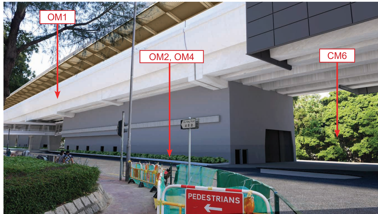
DAY 1 WITH MITIGATION