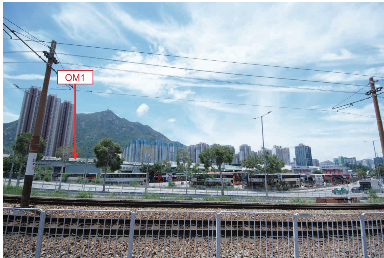
DAY 1 WITH MITIGATION