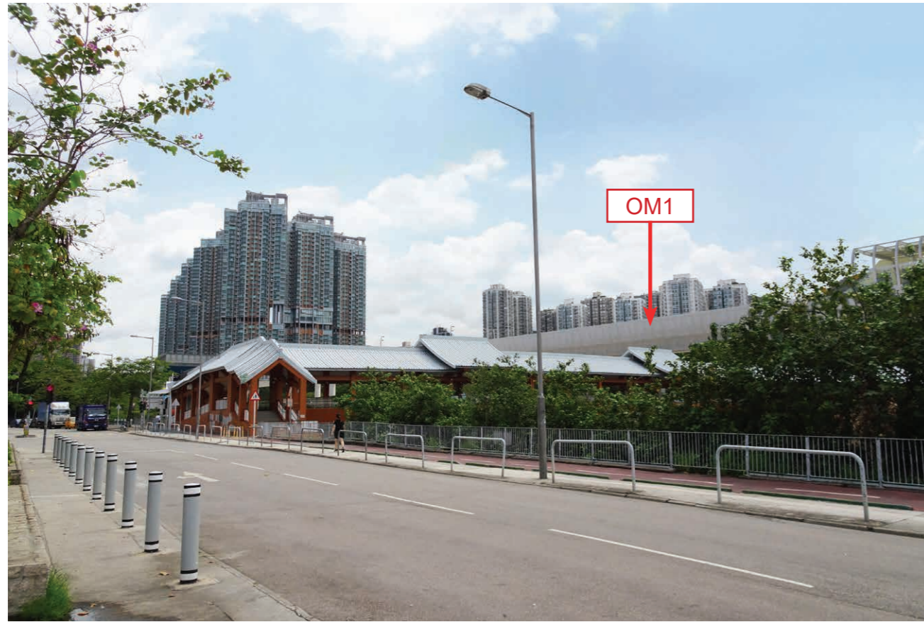
DAY 1 WITH MITIGATION