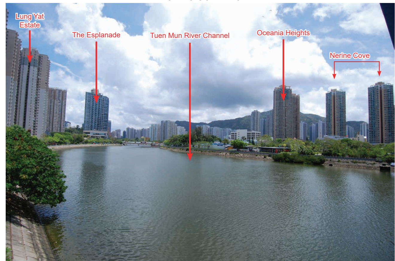
DAY 1 WITH MITIGATION