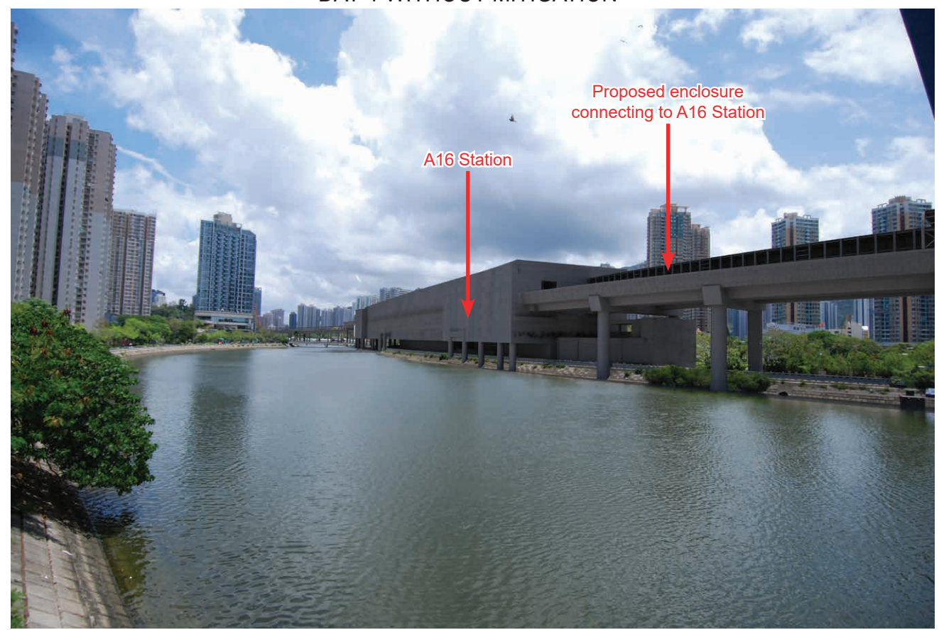
YEAR 10 WITH MITIGATION