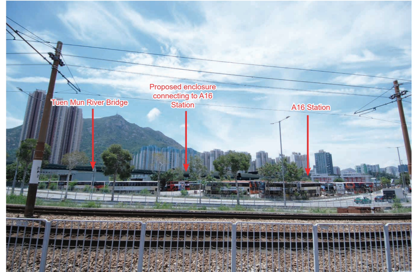
DAY 1 WITHOUT MITIGATION