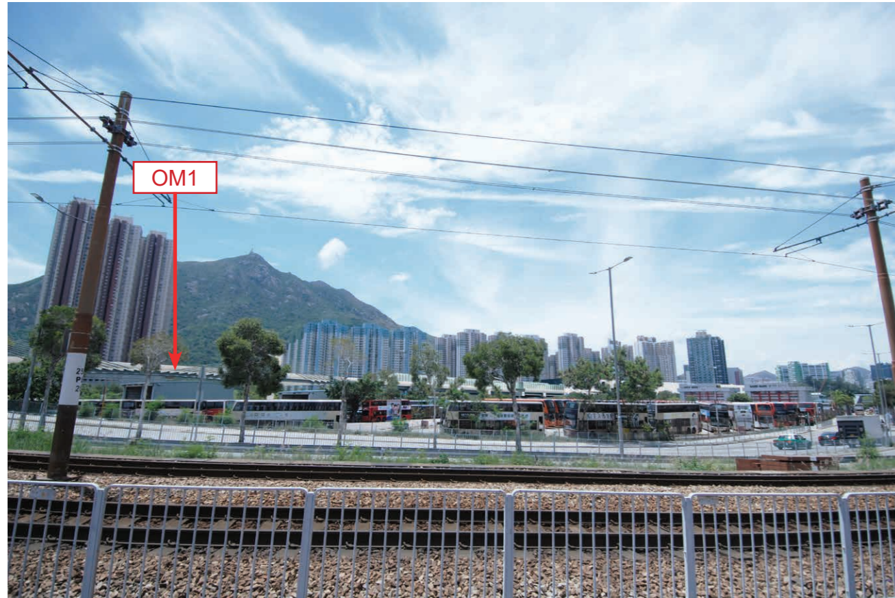
DAY 1 WITH MITIGATION