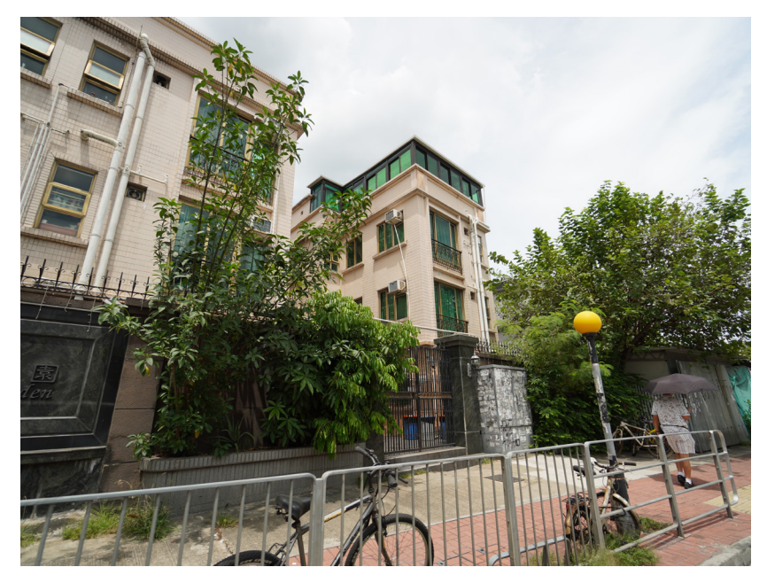
LR-4.1 LANDSCAPE AREAS IN VILLAGE DEVELOPMENT AREA