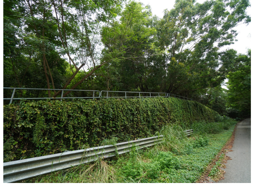
LR-3 VEGETATION ON ROADSIDE ENGINEERED SLOPES