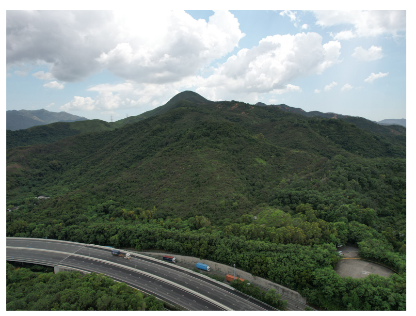
LR-1.1 VEGETATION ON NATURAL TERRAIN