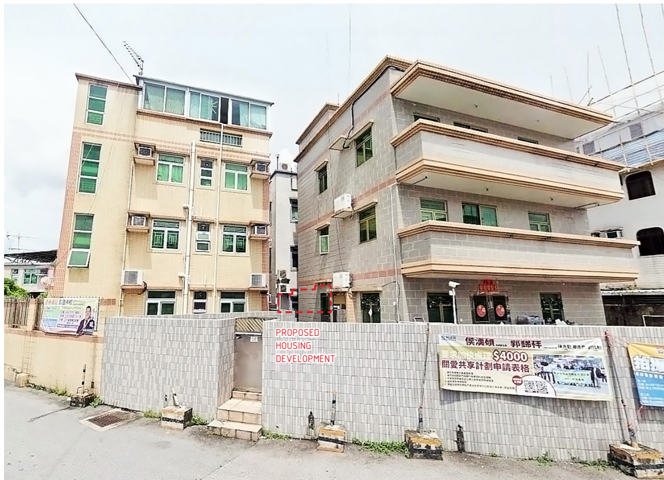
PHOTOMONTAGE WITHOUT MITIGATION AND WITH MITIGATION IN DAY 1 AND YEAR 10

(HOUSING DEVELOPMENT WILL BE BLOCKED BY EXISTING BUILDINGS AT THIS VP)