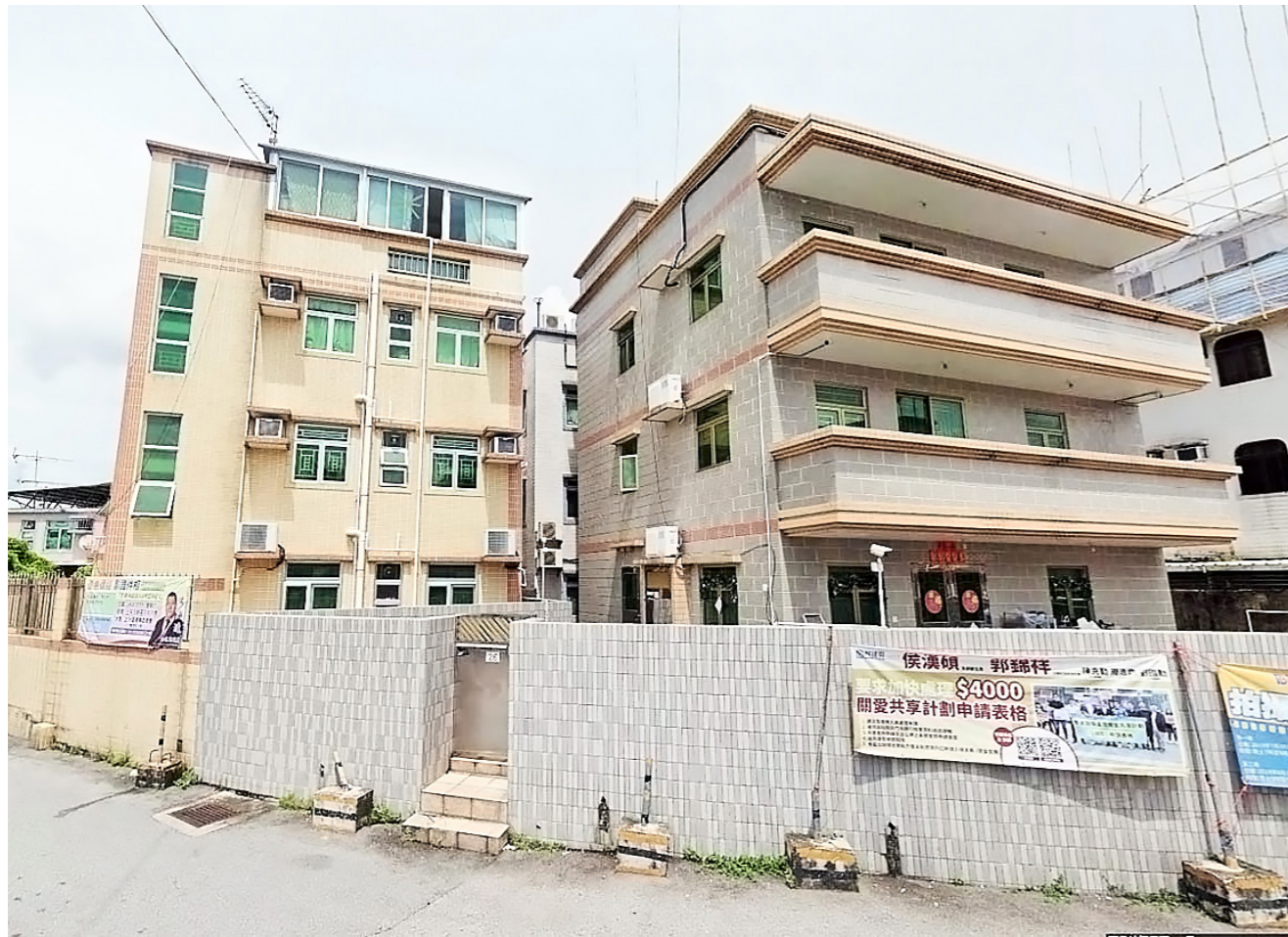
VP15 - HANG TAU VILLAGE - EXISTING SITE CONDITION