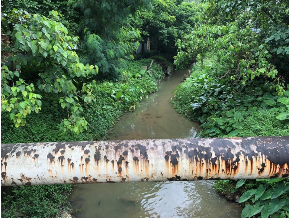
P5: TKL05 watercourse