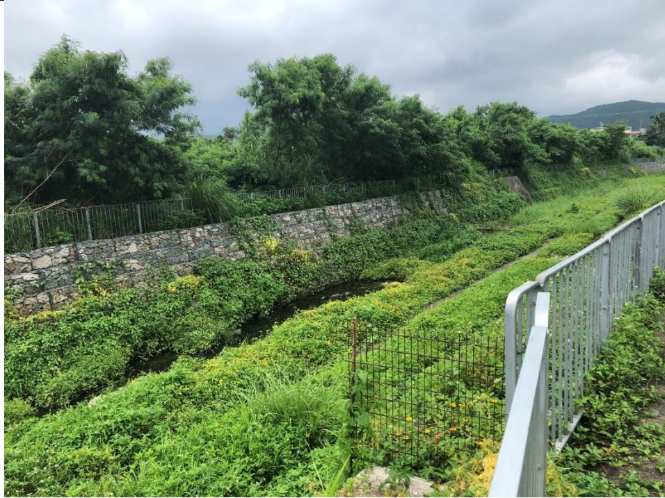
P3: TKL05 watercourse