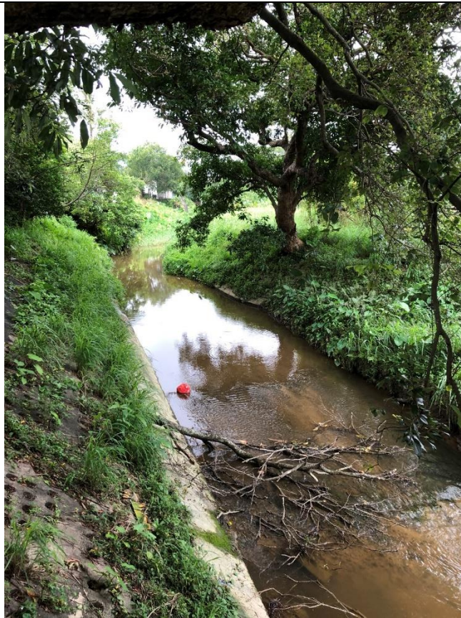
P4: TKL05 watercourse