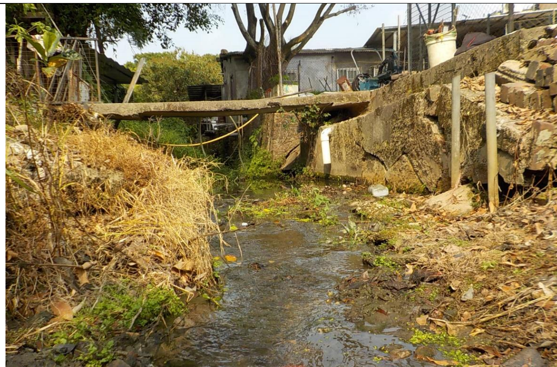
P8: TKL04 watercourse