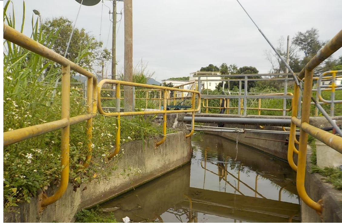
P7: TKL04 watercourse