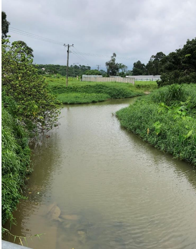
P1: Junction of TKL05 watercourse and Ping Yuen River (River Ganges) near Shenzhen River