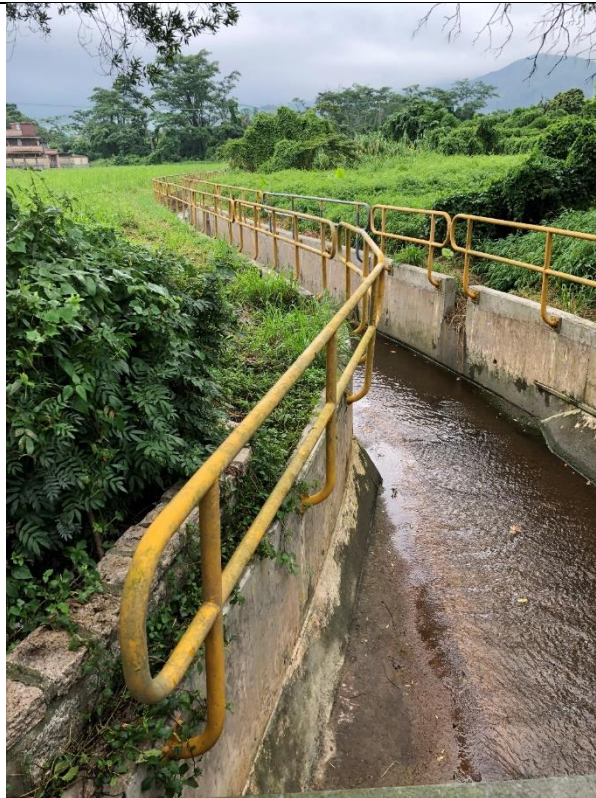
P6: TKL04 watercourse