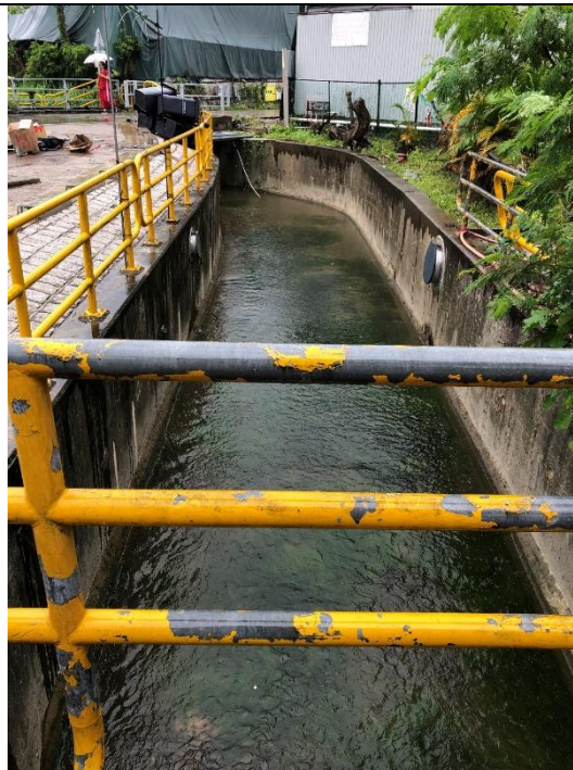
P2: TKL05 watercourse