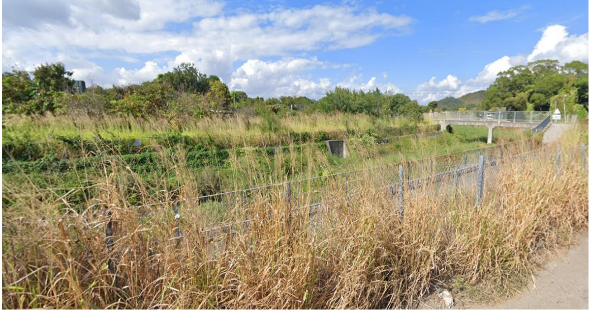
P11: Watercourse near Ping Che