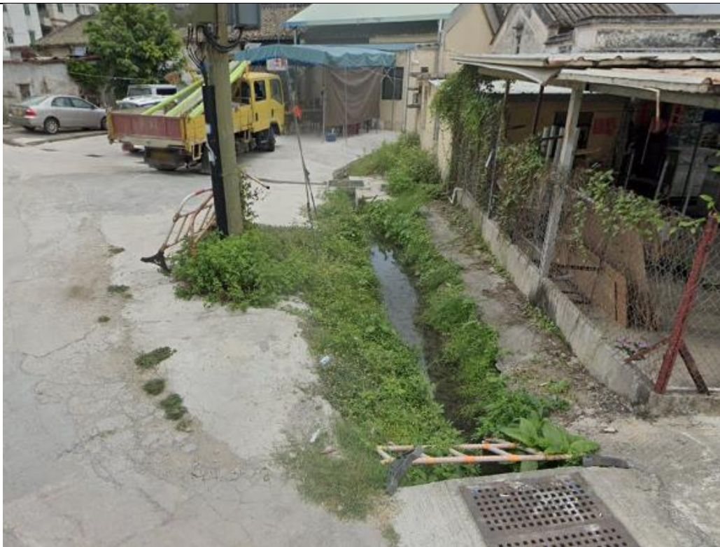
P10: Watercourse near Ping Yeung