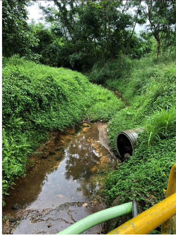
P9: TKL04 watercourse