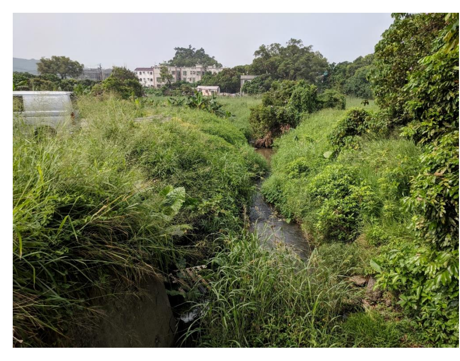
LR 2 - Water Course