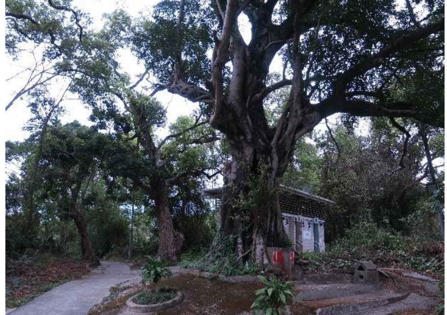
LR 5 - Fung Shui Woodland