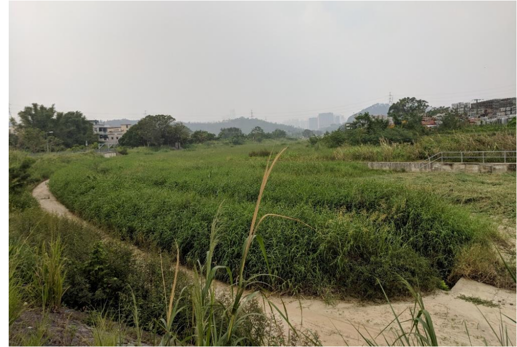
LR 6 - Scrubland / Grassland Mosaic