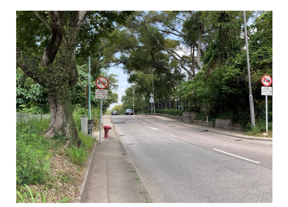
LR 10 - Key Transportation Corridor