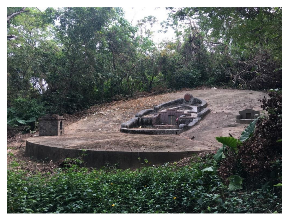
LR 11 - Cultural Feature