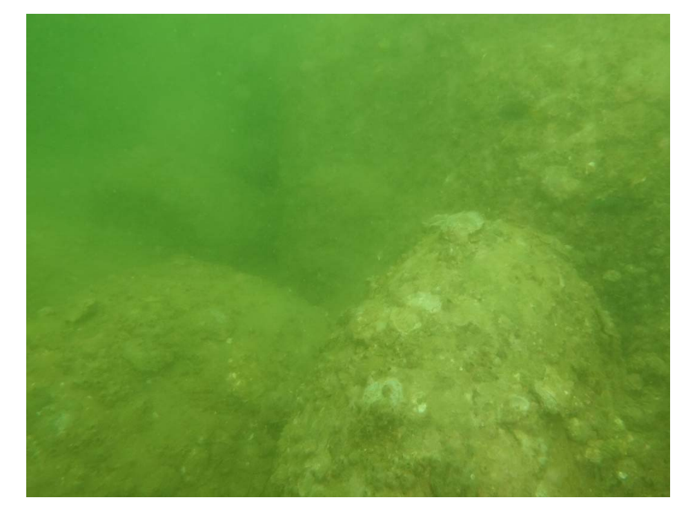
c) Rocky substratum was recorded at shallow area of Location C3