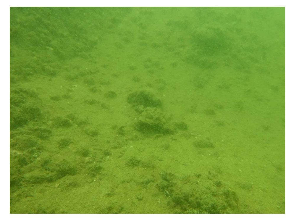
b) Rocky substratum was recorded at shallow area of Location C2