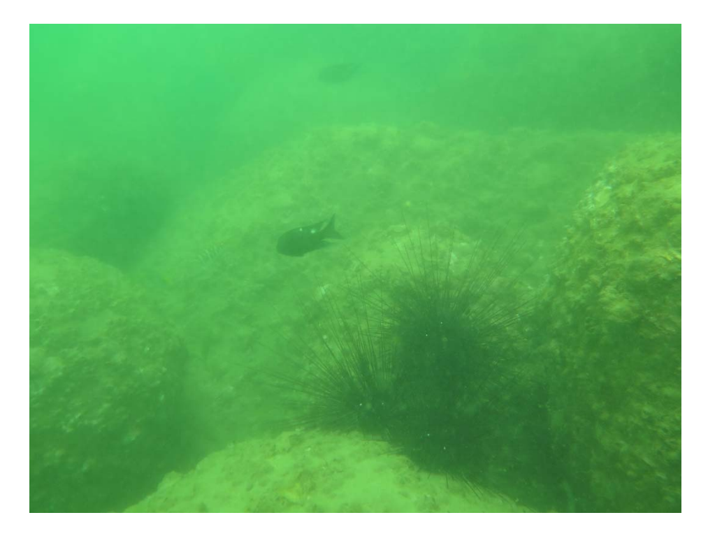
c) Rocky substratum was recorded at deep area of Location C3