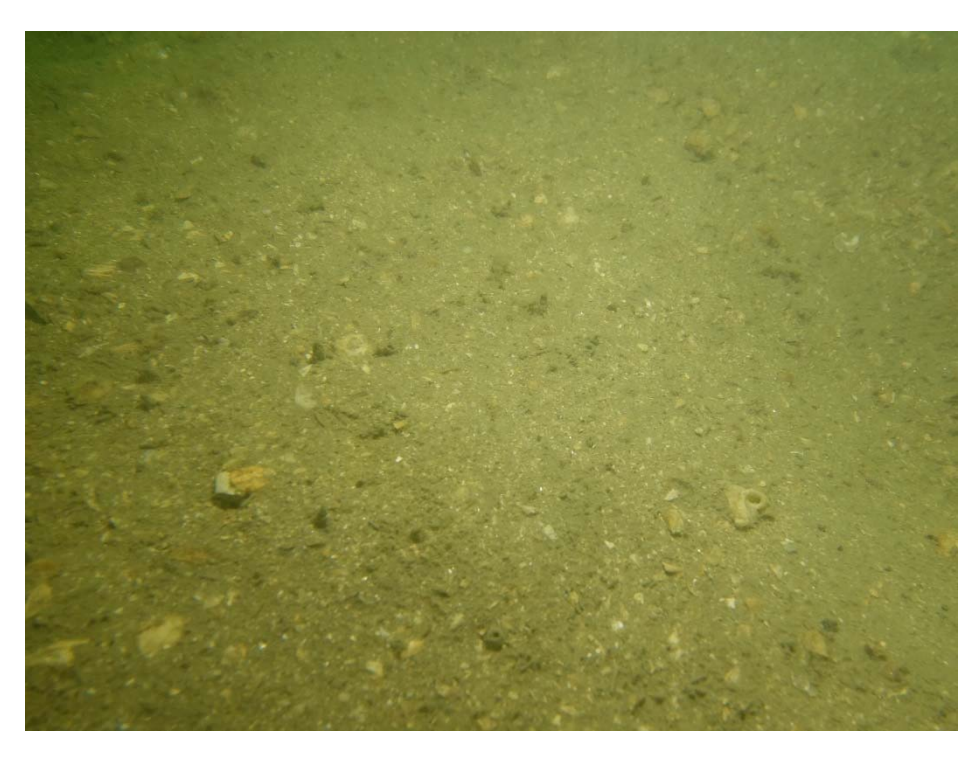
e) Sandy substratum was recorded at deep area of Location C2