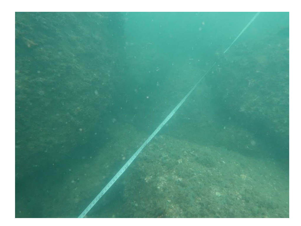
a) Rocky substratum was recorded at shallow area of Location C1