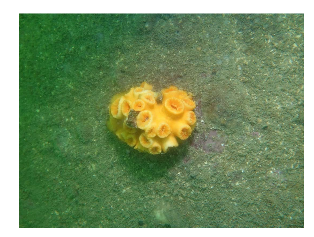
f) Ahermatypic hard coral ( Tubastraea sp./ Dendrophyllia sp.) was recorded at deep area of Location C3