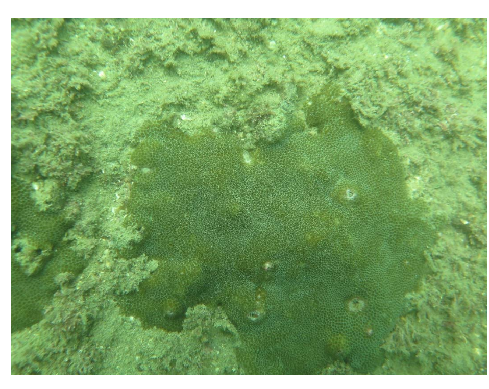
b) Hard coral ( Porites sp.) was recorded at shallow area of Location C2