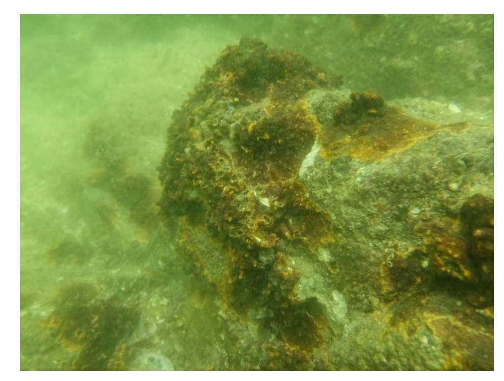
c) Other benthos (Bryozoan) was recorded at shallow area of Location C3