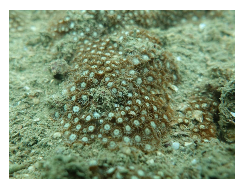
d) Hard coral ( Bernardpora stutchburyi ) was recorded at deep area of Location C1