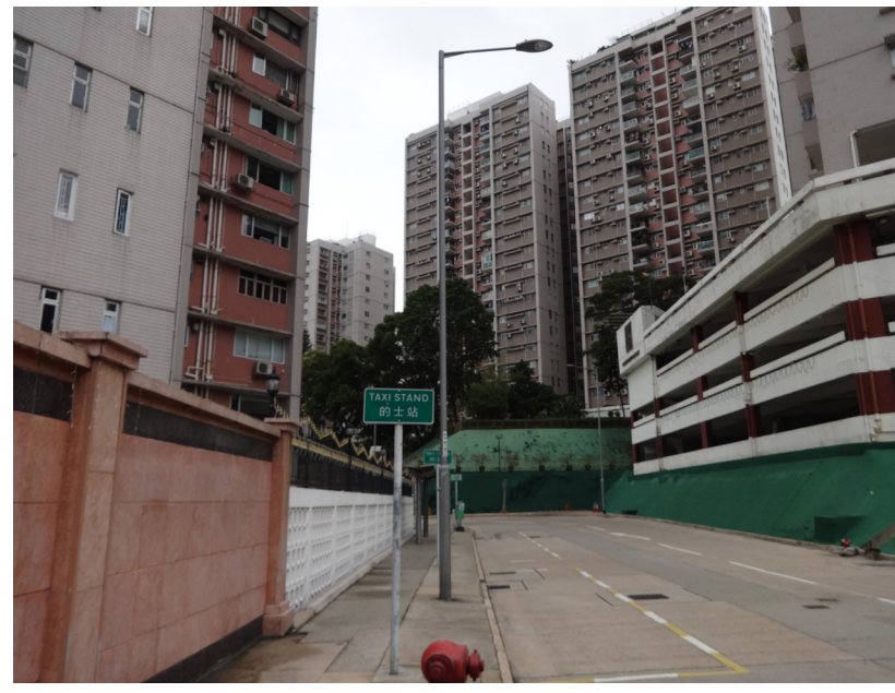
LR-5.3 LANDSCAPE AREAS IN URBAN DEVELOPMENT AREA NEAR HUNG MUI KUK