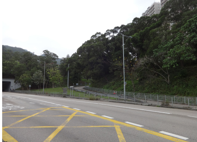
LR-3.3 VEGETATION IN OTHER ROADSIDE AREAS