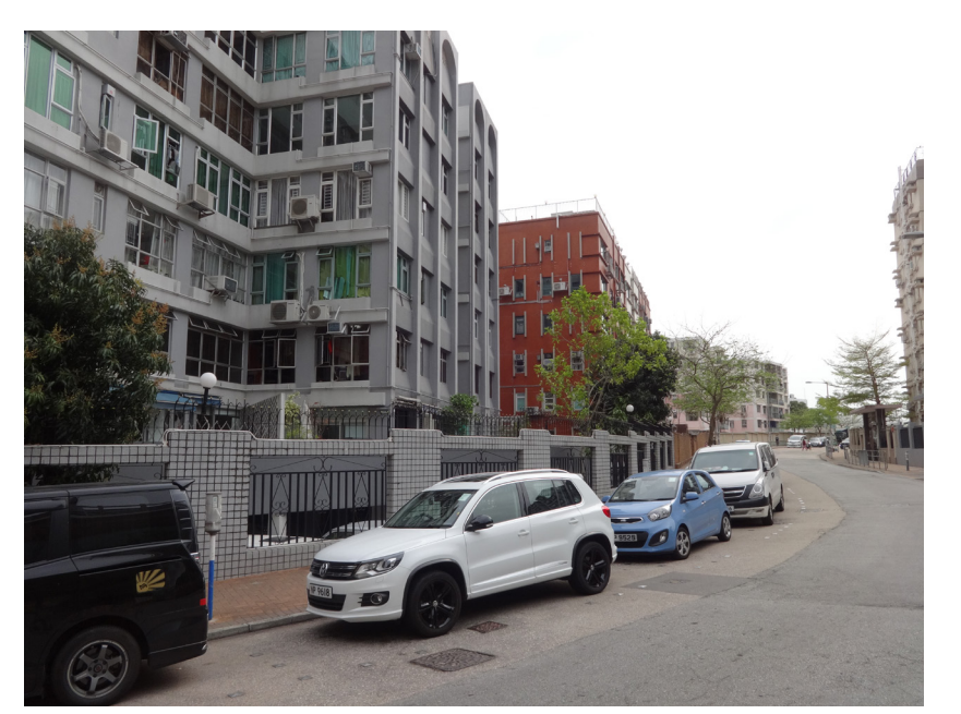
LR-5.1 LANDSCAPE AREAS IN URBAN DEVELOPMENT AREA IN KOWLOON TONG