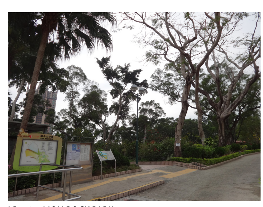
LR-4.3 LION ROCK PARK