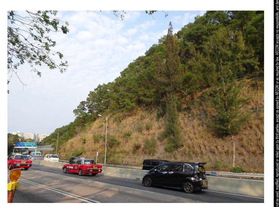
LR-3.2 VEGETATION ON ROADSIDE ENGINEERED SLOPES FROM TAI WAI TO SHA TIN TAU