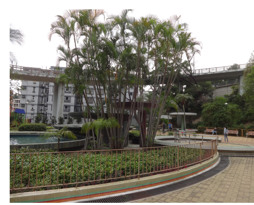
BROADCAST DRIVE GARDEN