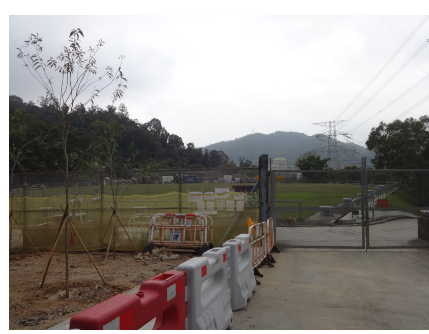
LR-6.2 VEGETATED AREAS IN SHATIN SOUTH FRESH WATER SERVICE RESERVOIR AND ASSOCIATED LANDSCAPE AREAS