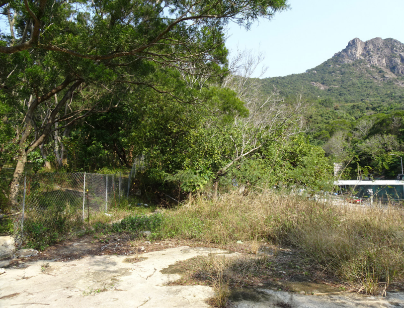
LR-6.3 VEGETATED AREAS IN FENCED-OFF AREA