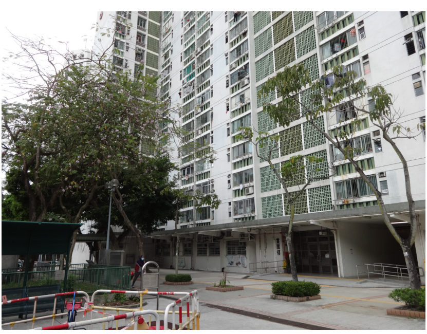
LR-5.4 LANDSCAPE AREAS IN URBAN DEVELOPMENT AREA NEAR SHATIN TAU