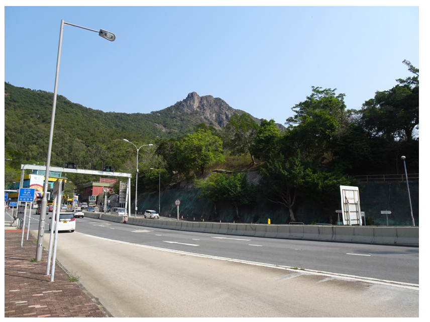
LR-3.1 VEGETATION ON ROADSIDE ENGINEERED SLOPES IN KOWLOON TONG