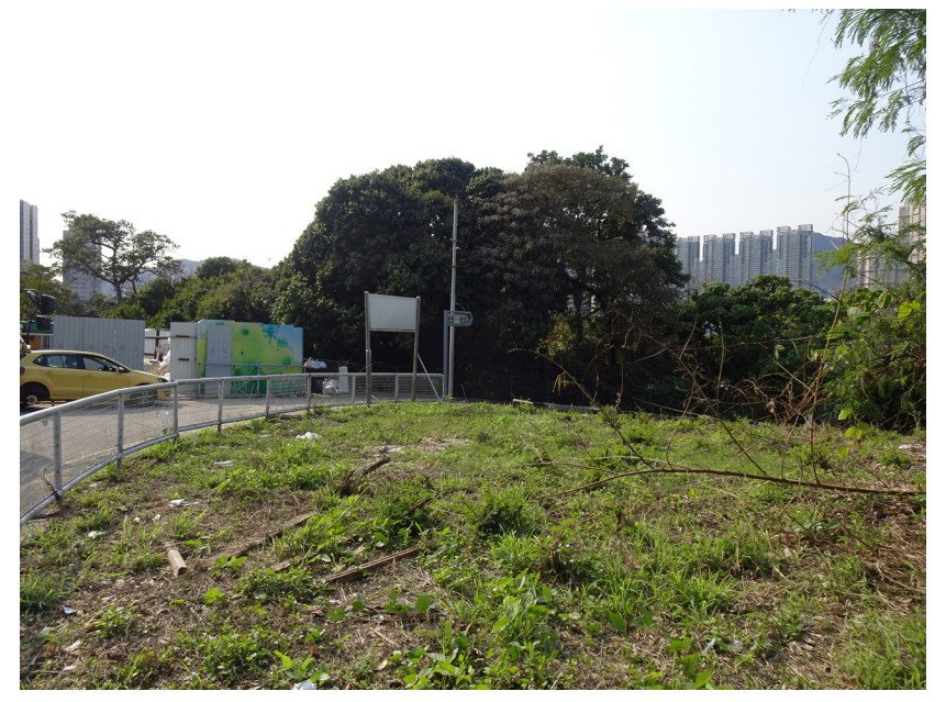
LR-1.2 VEGETATION IN VILLAGE AREAS NEAR KAKTIN