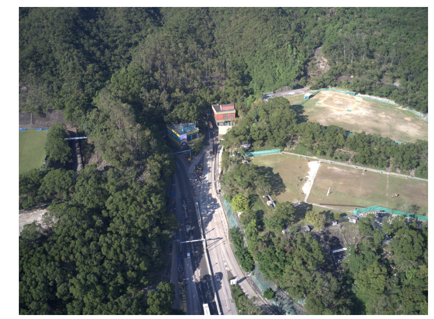
VEGETATED AREAS IN SERVICE RESERVOIRS AND ASSOCIATED LANDSCAPE AREAS IN KOWLOON SIDE