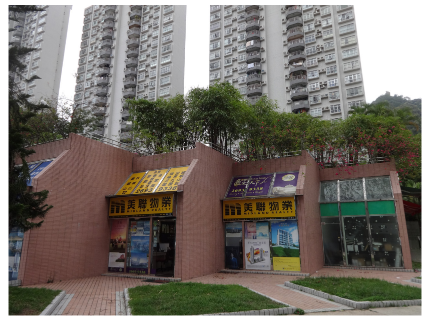
LR-5.2 LANDSCAPE AREAS IN URBAN DEVELOPMENT AREA IN TAI WAI