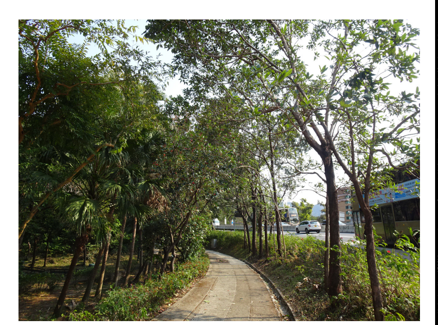
LR-4.2 LUNG CHEUNG ROAD PARK