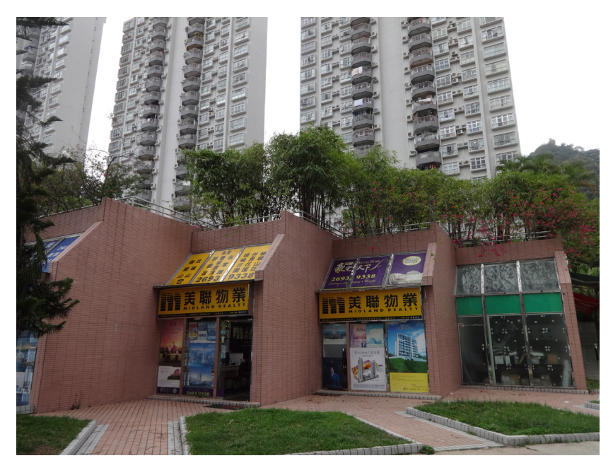
LR-5.2 LANDSCAPE AREAS IN URBAN DEVELOPMENT AREA IN TAI WAI