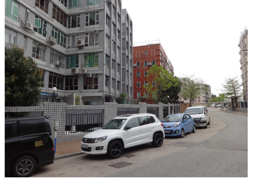
LR-5.1 LANDSCAPE AREAS IN URBAN DEVELOPMENT AREA IN KOWLOON TONG