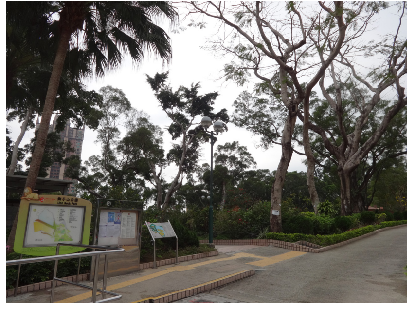
LR-4.3 LION ROCK PARK