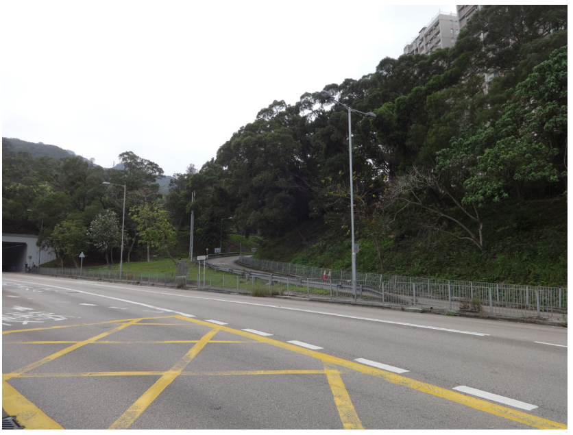
LR-3.3 VEGETATION IN OTHER ROADSIDE AREAS