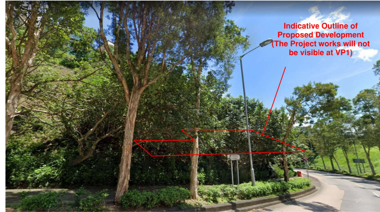
Day 1 of Operation without Mitigation Measure