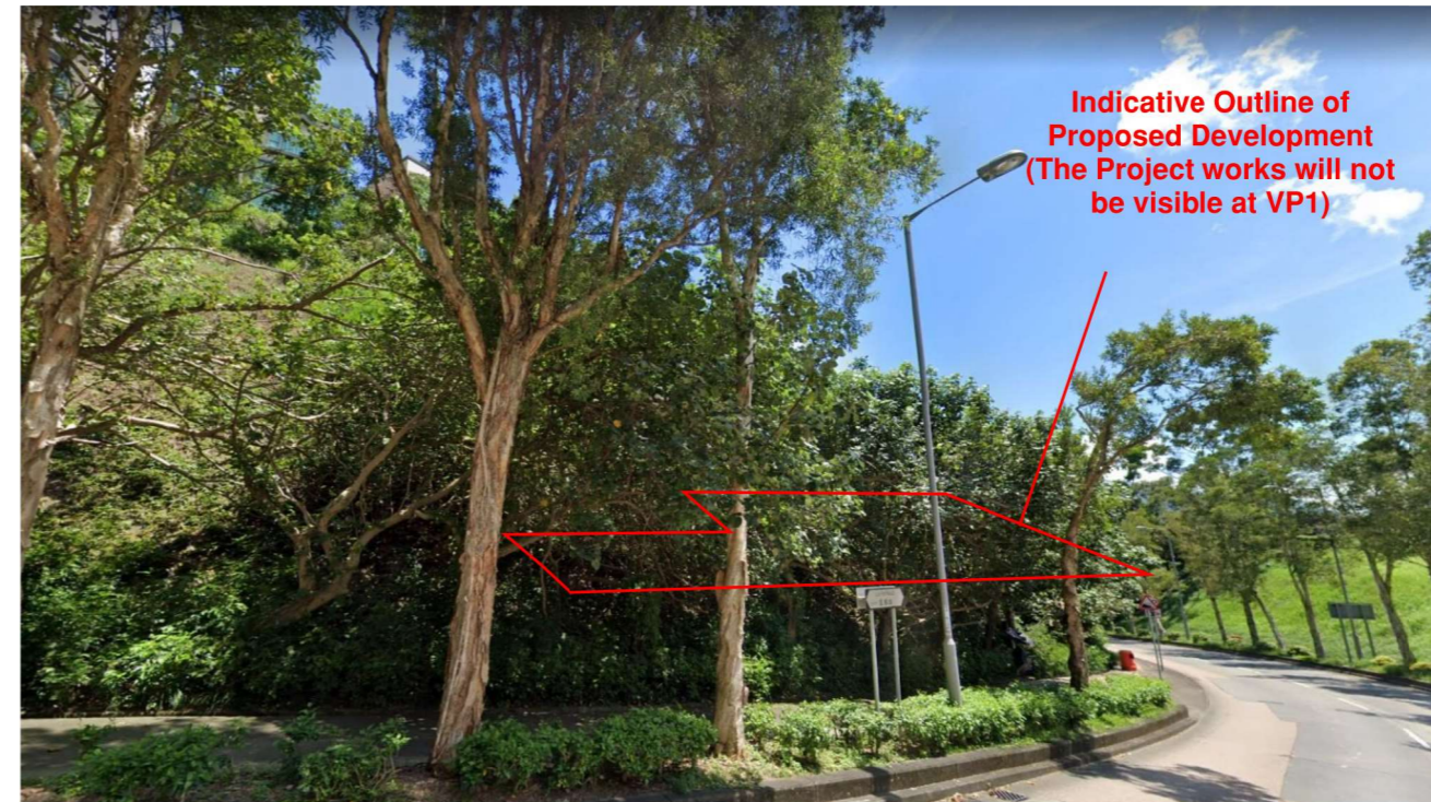
Year 10 of Operation with Mitigation Measure