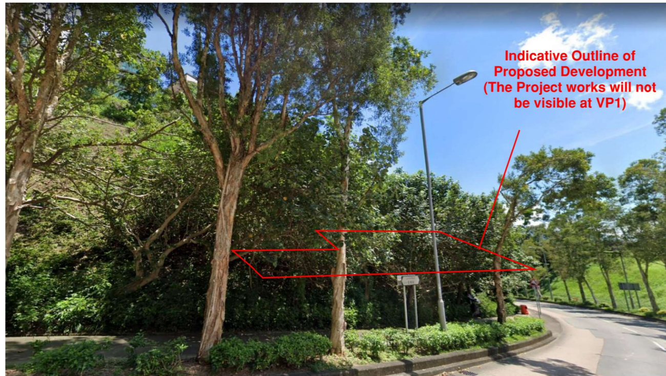
Day 1 of Operation with Mitigation Measure