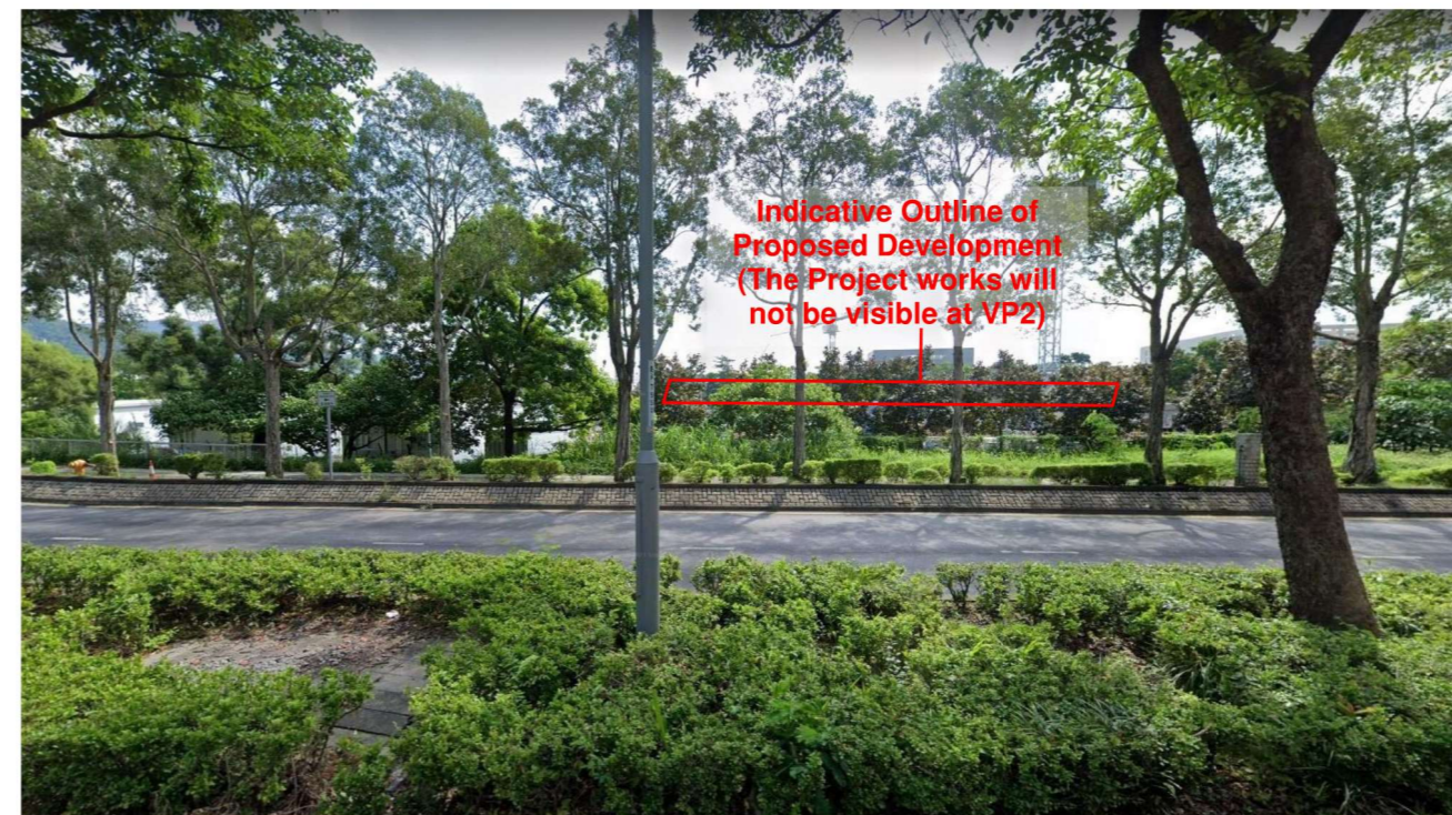
Year 10 of Operation with Mitigation Measure