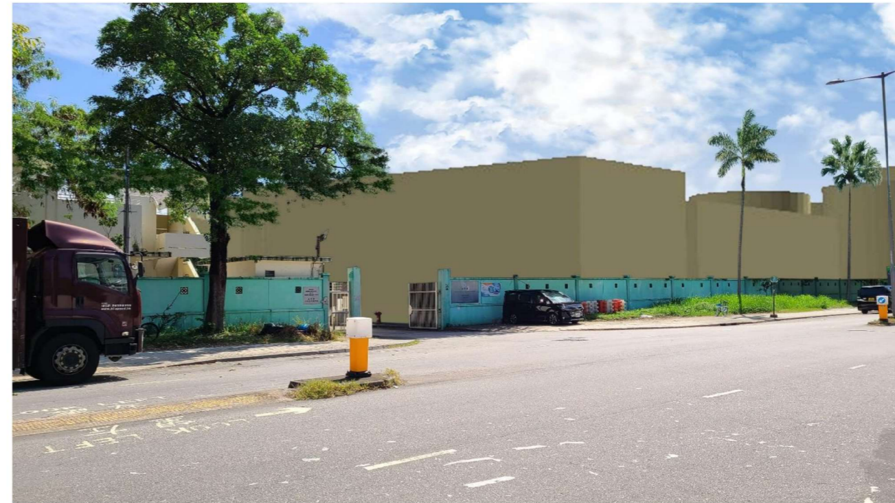
Day 1 of Operation without Mitigation Measure