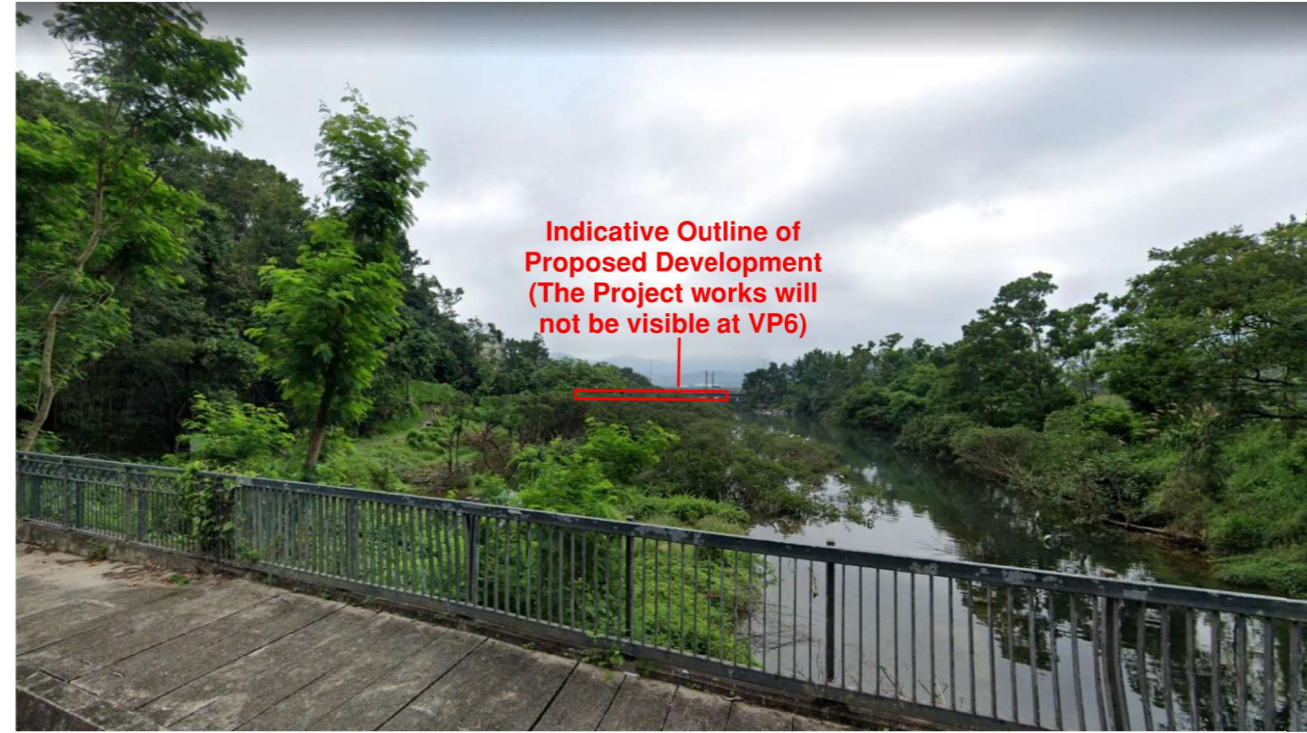
Day 1 of Operation without Mitigation Measure