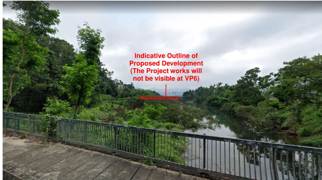
Day 1 of Operation with Mitigation Measure