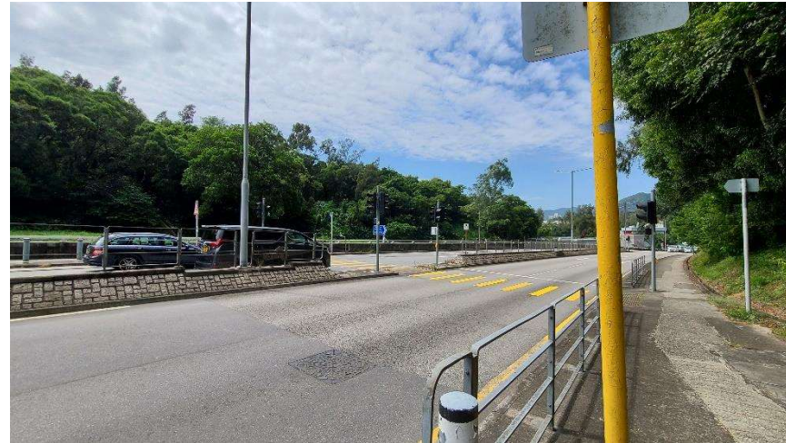
LR 9.4 – Existing Road (Ting Kok Road)