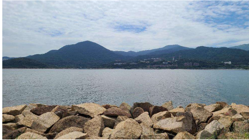
LR 8 – Tolo Harbour