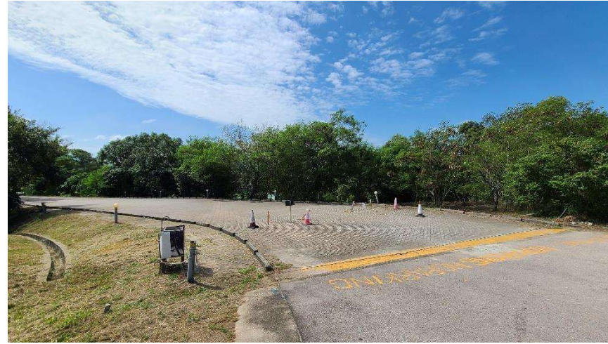
LR 9.1 – Golf Driving Range and Facilities on Shuen Wan Restored Landfill