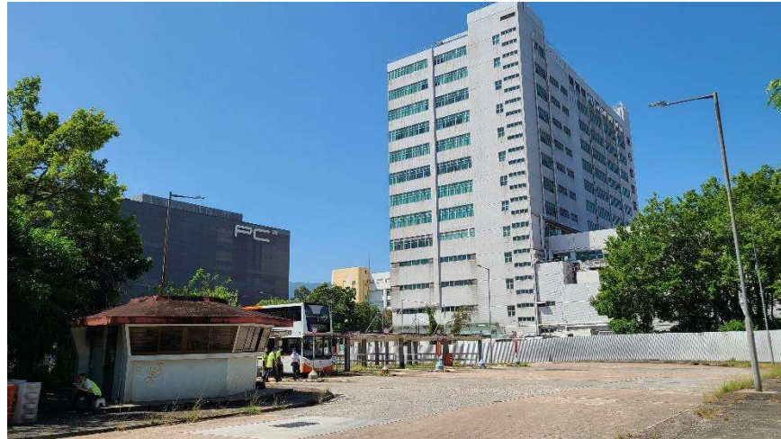
LR 9.3 – Tai Po Industrial Estate