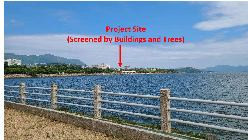
V2 – Visitors of Tai Po Waterfront Park