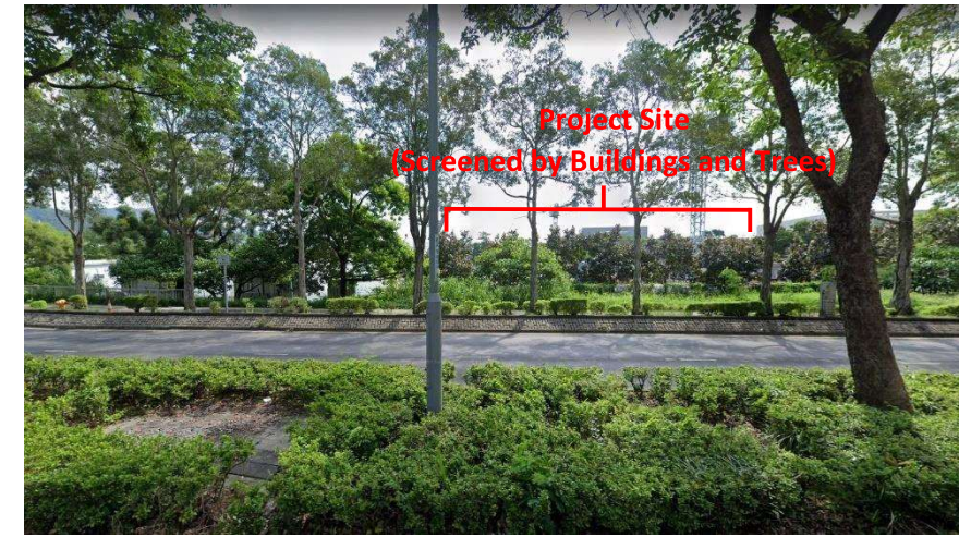
R3 – Residents of High-rises along Yuen Shin Road