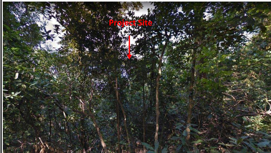
V10 – Visitors of Tai Po Kau Nature Trail