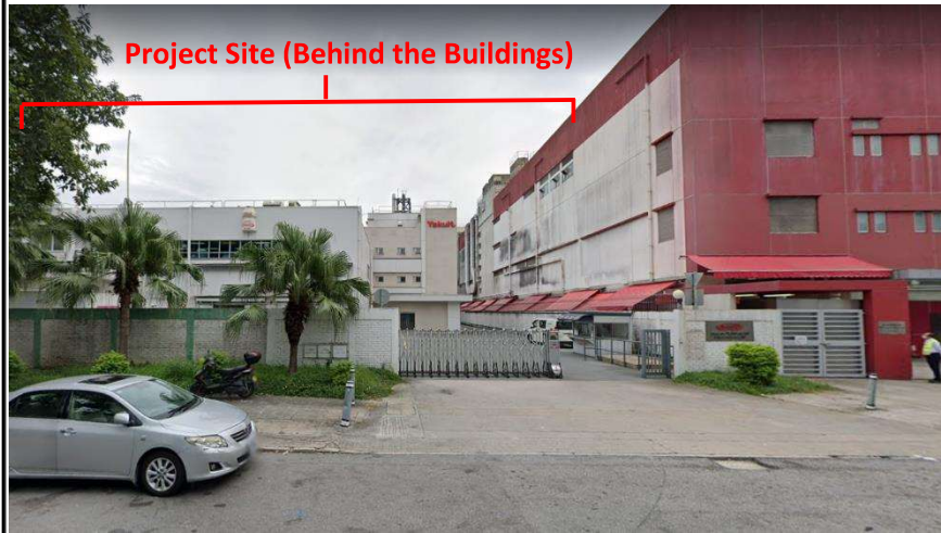
O1 – Occupants of Tai Po Industrial Estate (from North)