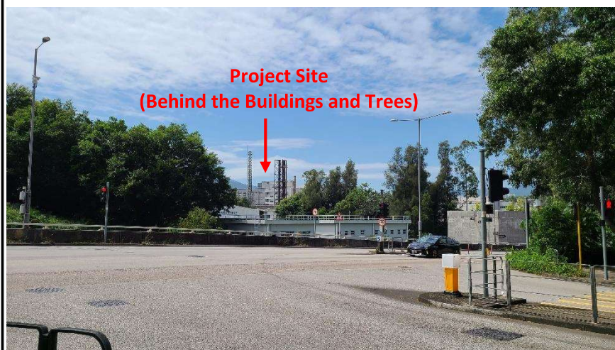
T2 – Travellers of Ting Kok Road