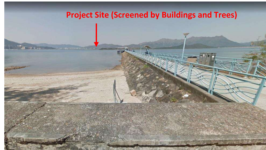
V11 – Visitors of Wu Kwai Sha Youth Village