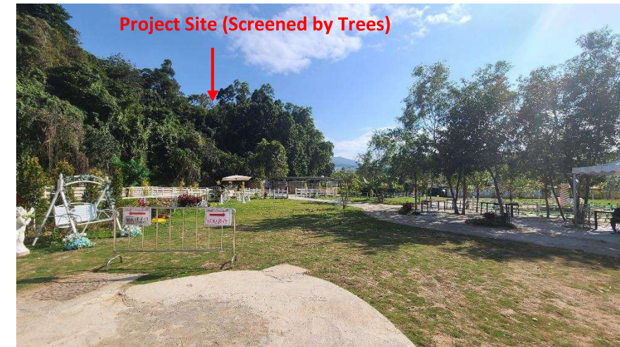
V9 – Visitors of Recreational Facilities near Fung Mei Wai