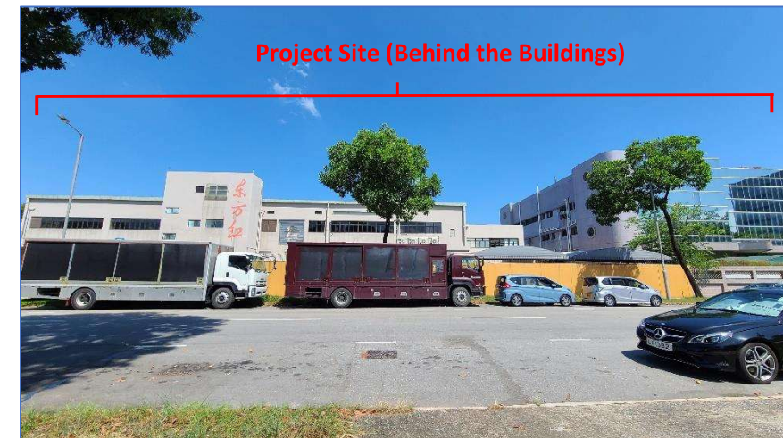
O3 – Occupants of Tai Po Industrial Estate (from South)