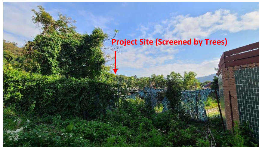
R8 – Residential Development around Mak Uk