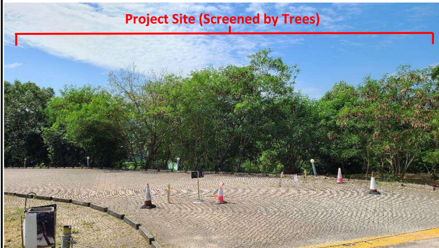
V1 – Visitors of Golf Course at Shuen Wan Restored Landfill