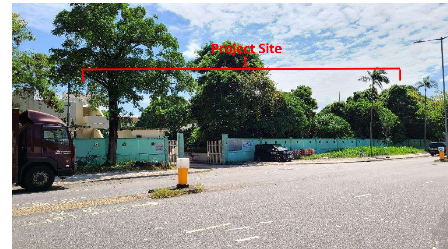
T1 – Travellers of Dai Kwai Street