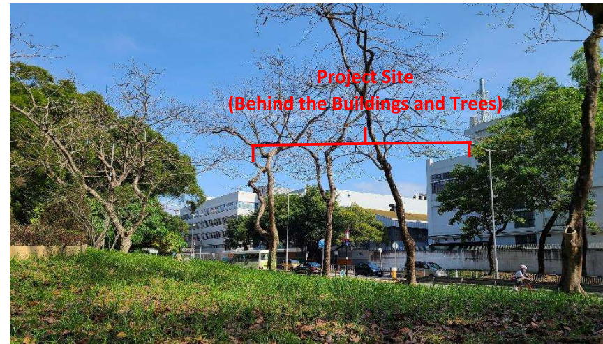
V8 – Visitors of Ha Hang Village Sitting-out Area