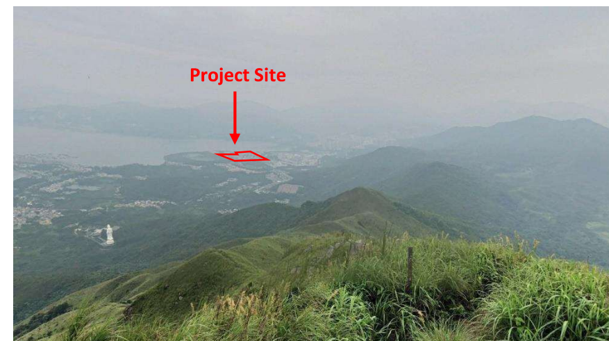
V6 – Visitors of Wilson Trail