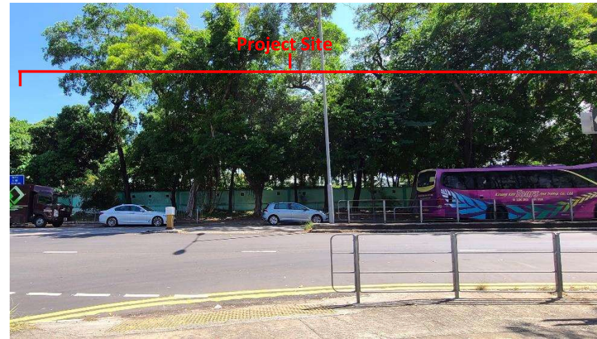
O2 – Occupants of Tai Po Industrial Estate (from West)