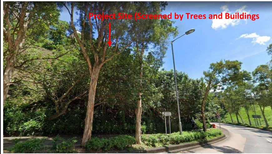
R1 – Residents of Low-rises along Low Fai Road