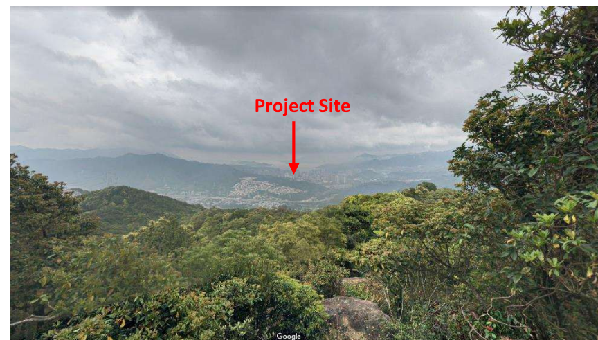
V5 – Visitors of Ngau Kwu Leng Hiking Trail