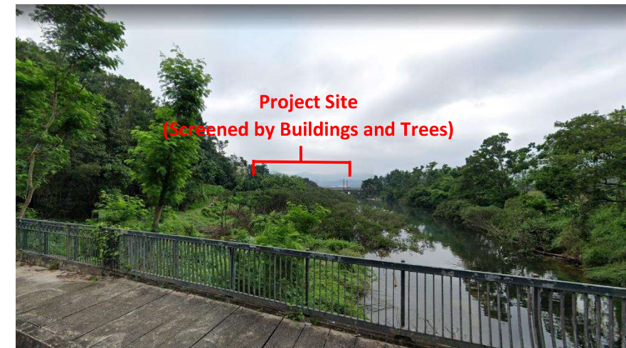
R9 – Residential Development along Hung Lam Drive