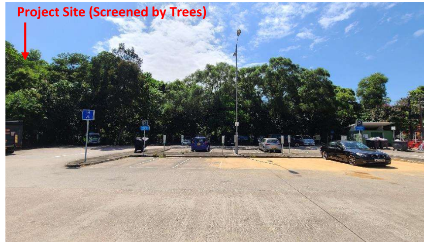
R2 – Residents of Low-rises along Ting Kok Road