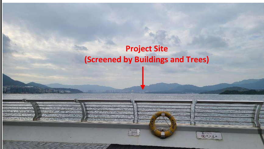
V4 – Visitors of Ma On Shan Promenade and Ma On Shan Park