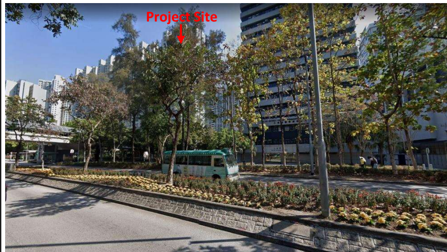
R7 – Residential Development in Tai Po New Town