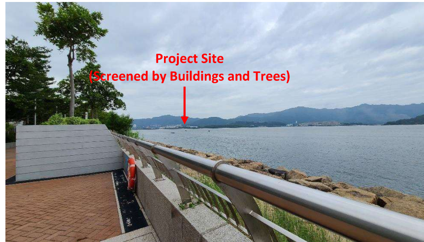
R5 – Residential Development along Pak Shek Kok Promenade