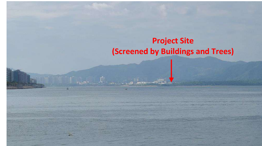
R6 – Residential Development along Ma On Shan Promenade