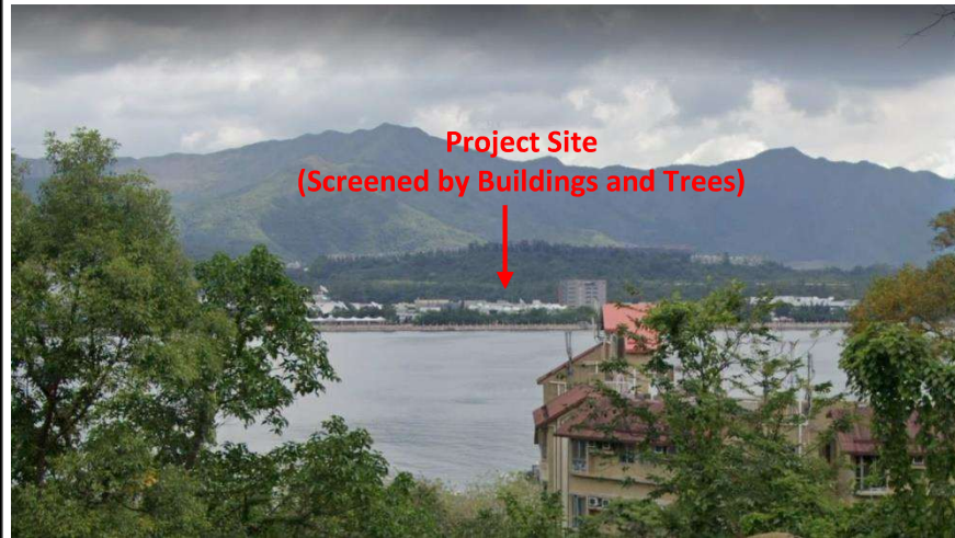
R4 – Residents of Low-rises along Tai Po Road (Tai Po Kau)