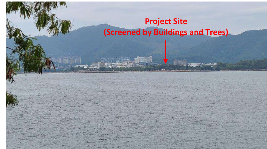
V3 – Visitors of Pak Shek Kok Promenade