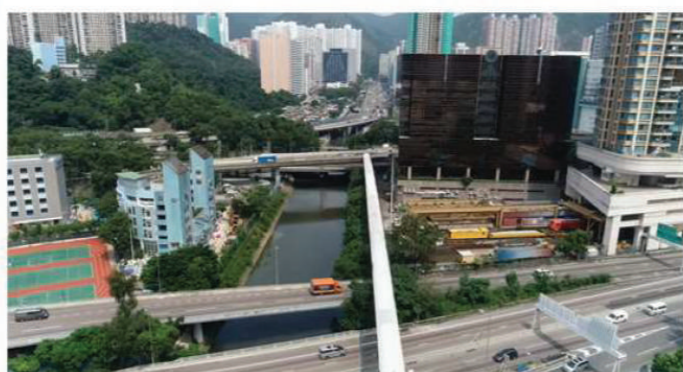
LCA2 - Miscellaneous Urban Fringe Landscape