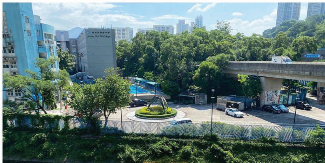
LR7 - Landscape Amenity within Build-up Area