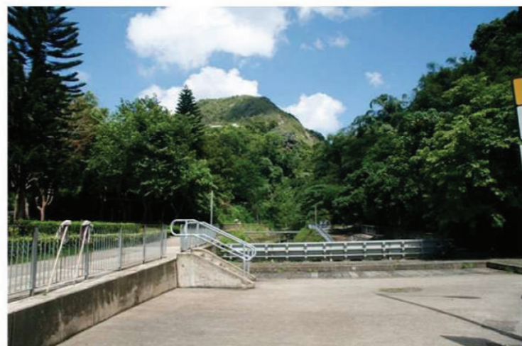
LR6 - Hillside Vegetation