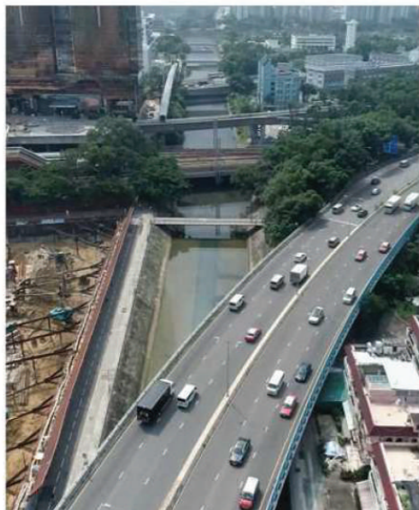
LR1 - Watercourse of Shing Mun River Channel and Fo Tan Nullah