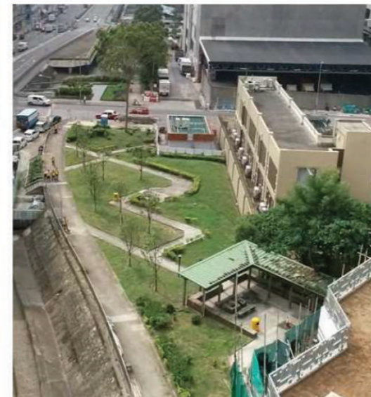
LR4 - Kwei Tei Street Garden