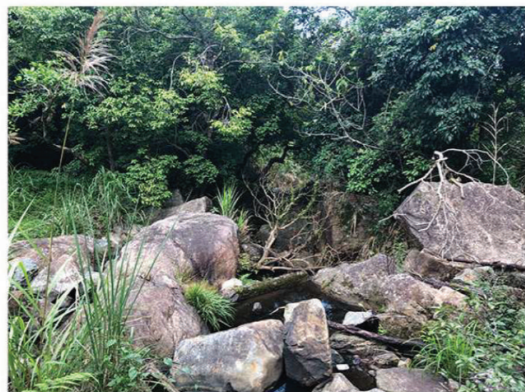
LR2 - Natural Watercourse