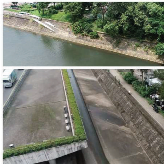
LR3 - Waterside Landscape Amenity along Fo Tan Nullah