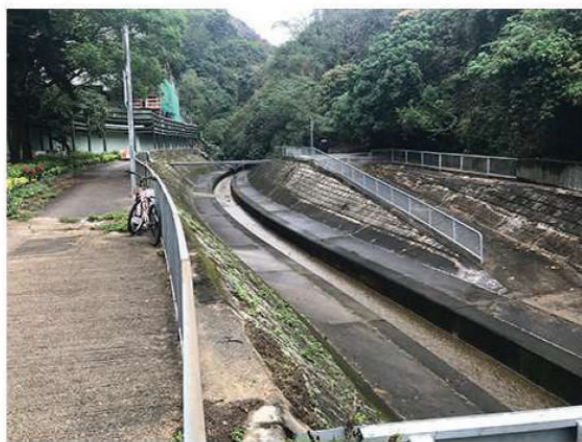
LCA1 - Settled Valley Landscape