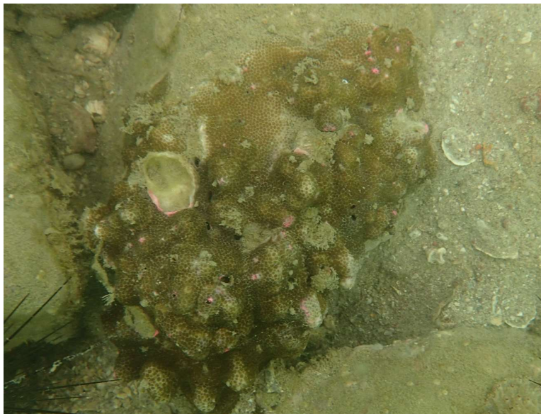
c) Hard coral species Porites sp. recorded during the survey.