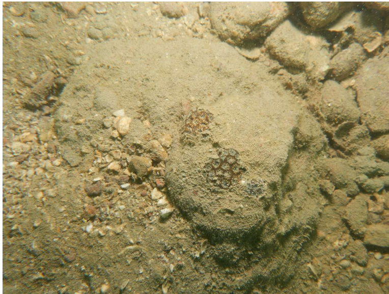
a) Rocky substrate with hard coral species Oulastrea crispata , sand and rubble on the seabed in shallow waters (-3 to -4 mCD).