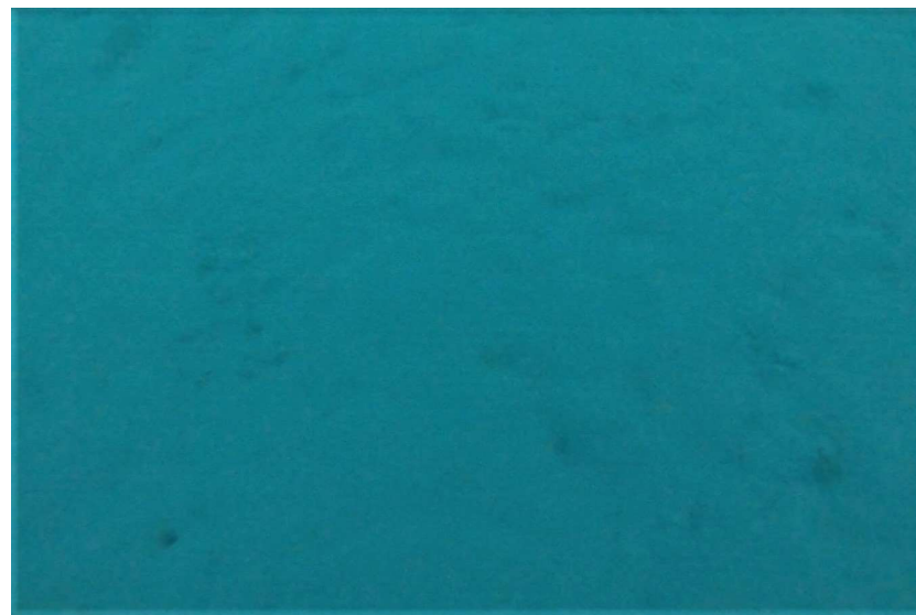
b) Soft substrate with silty seabed recorded at WCKH2.