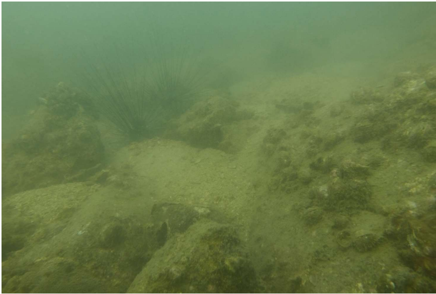
a) Seabed with boulders, sand and rocks mixture recorded in shallow waters (-3 to -4 mCD) at Transect T1.