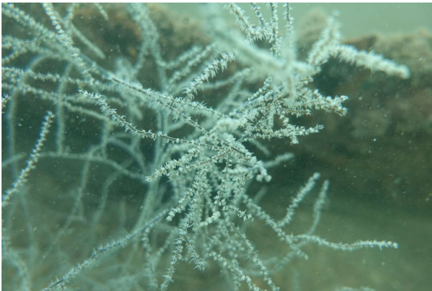
c) Black coral Antipathes curvata recorded at Transect T1.