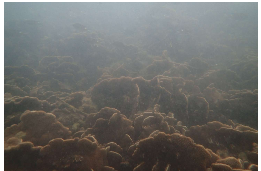
d) Abundant hard coral Pavona decussata recorded in shallow waters (-3 to -4 mCD) at Transect T2.