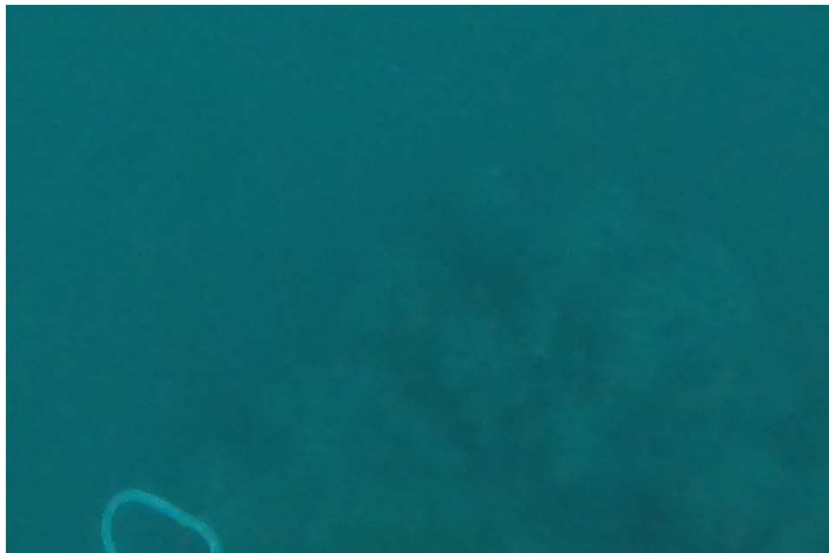
c) Soft substrate with silty seabed recorded at OTM3.