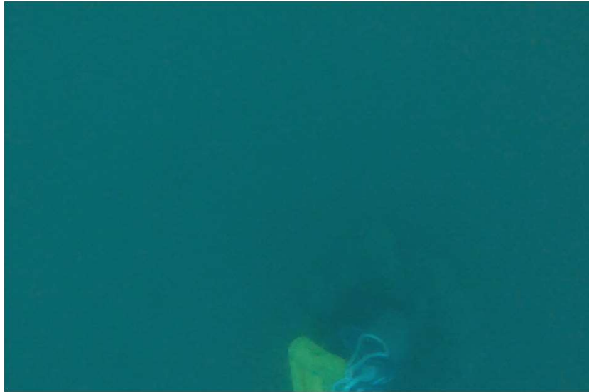
a) Soft substrate with silty seabed recorded at OTM1.