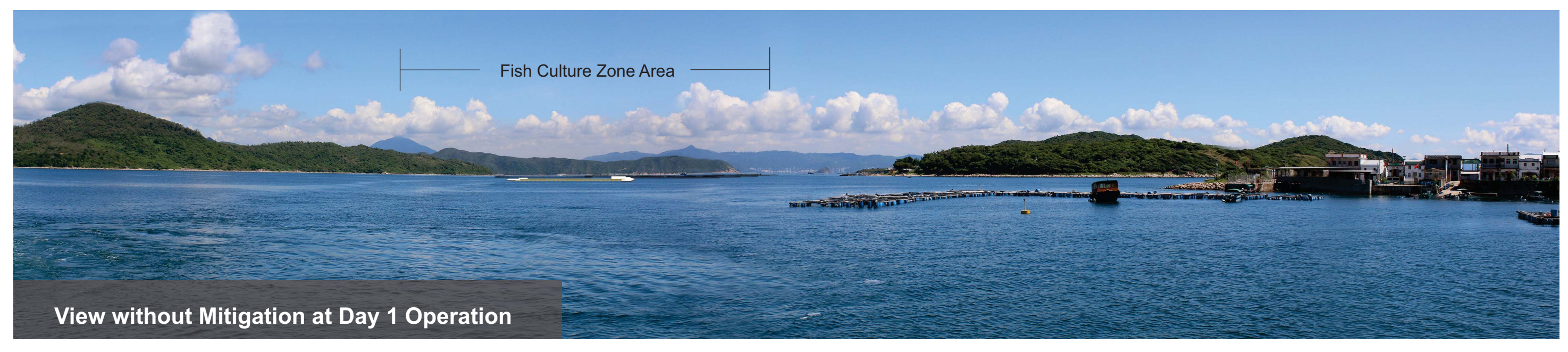
Remark: The structures on the sea within the Fish Culture Zone Area are fish cages (circular objects) / rafts (rectangular objects) / steel truss cages (yellow and white rectangular objects) for illustration purpose only.