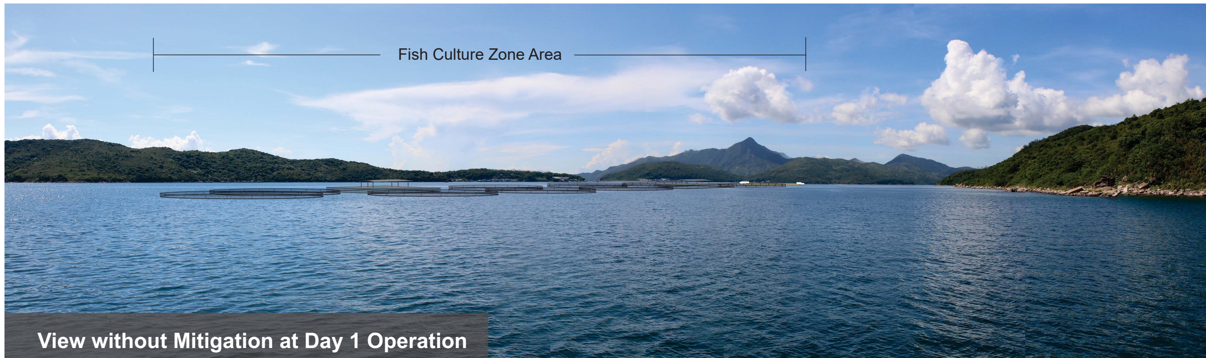
View without Mitigation at Day 1 Operation

Remark: The structures on the sea within the Fish Culture Zone Area are fish cages (circular objects) / rafts (rectangular objects) / steel truss cages (yellow and white rectangular objects) for illustration purpose only.