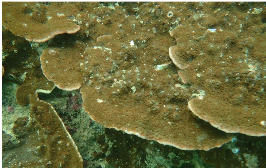
c) Photo of hard coral Montipora peltiformis taken during the survey