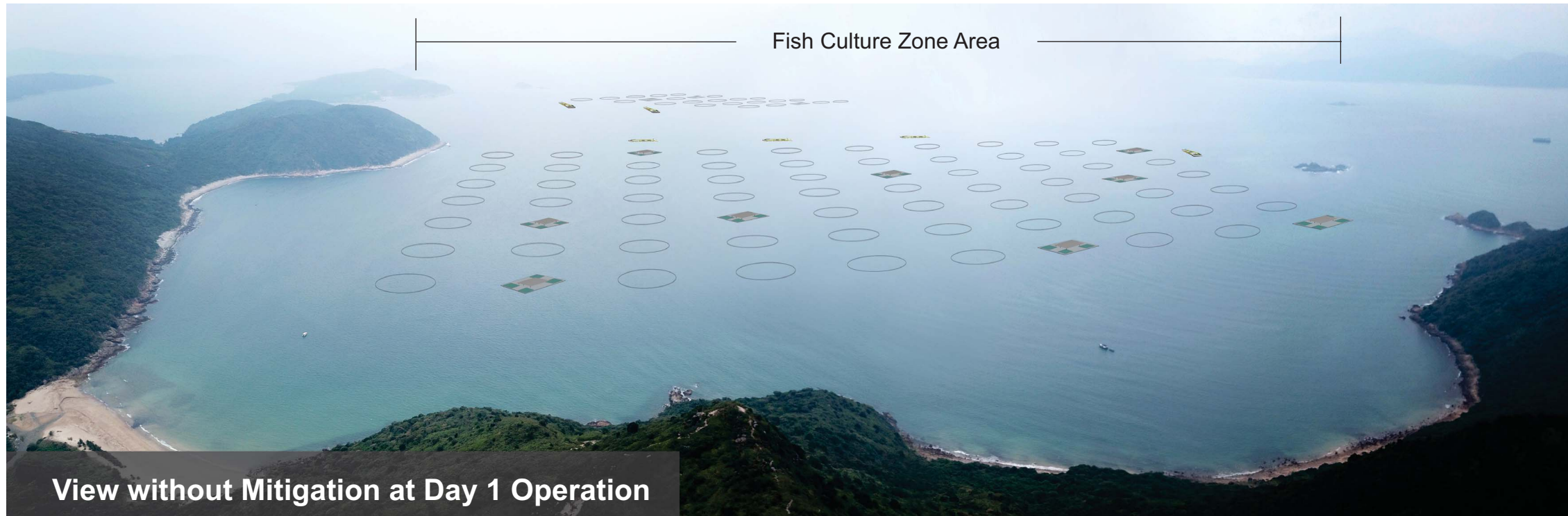
View without Mitigation at Day 1 Operation