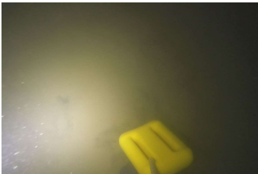
g) Soft substrate with silty mud at PT7.