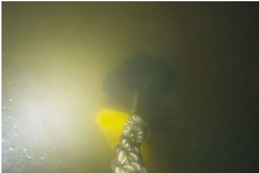
c) Soft substrate with silty mud at PT3.