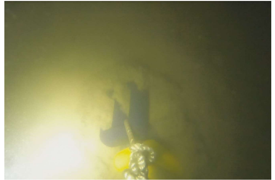
b) Soft substrate with silty mud at PT2.