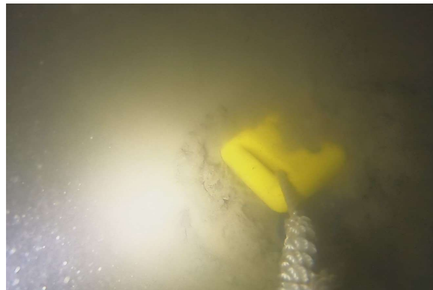
f) Soft substrate with silty mud at PT6.