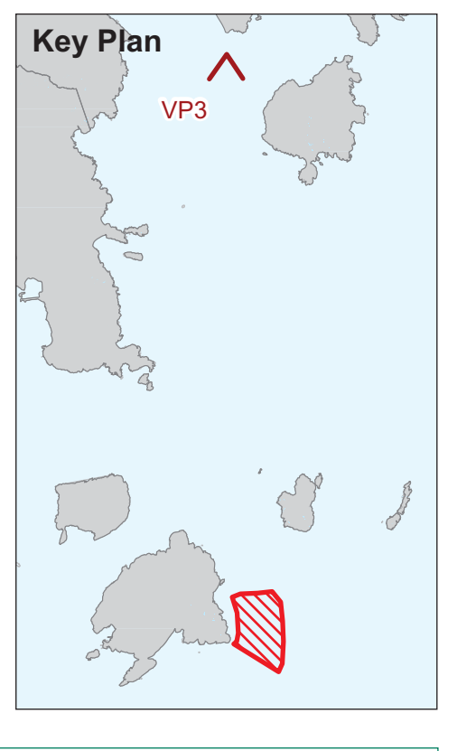
Date Photograph Taken: September 2021