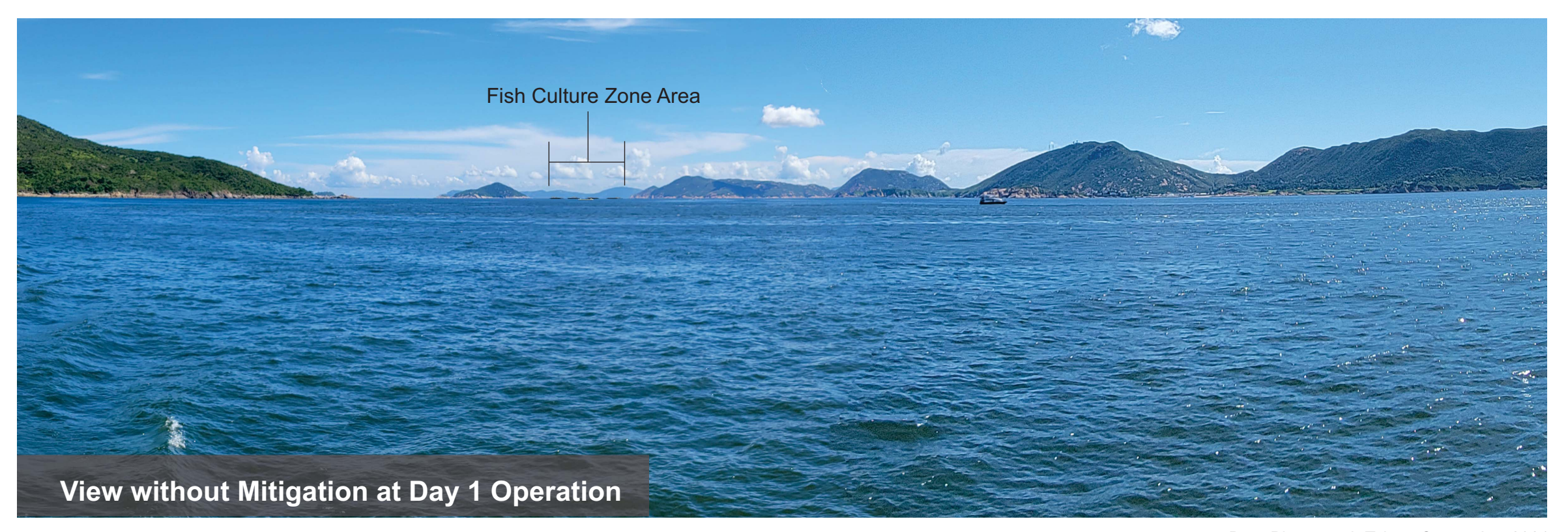
Remark: The structures on the sea within the Fish Culture Zone Area are fish cages (circular objects) / rafts (rectangular objects) / steel truss cages (yellow and white rectangular objects) for illustration purpose only.