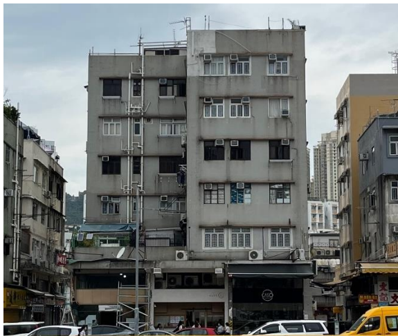
Plate 17 – NAP15: Shing Ho Building