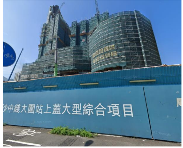
Plate 20 – NAP18: Planned Comprehensive Development Area Next to Tai Wai Station (Under Construction)