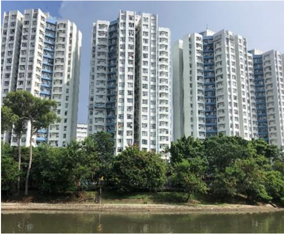
Plate 19 – NAP17: Man Lai Court