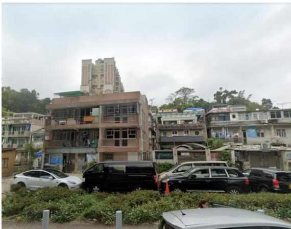
Plate 15 – NAP13: Tung Lo Wan Village