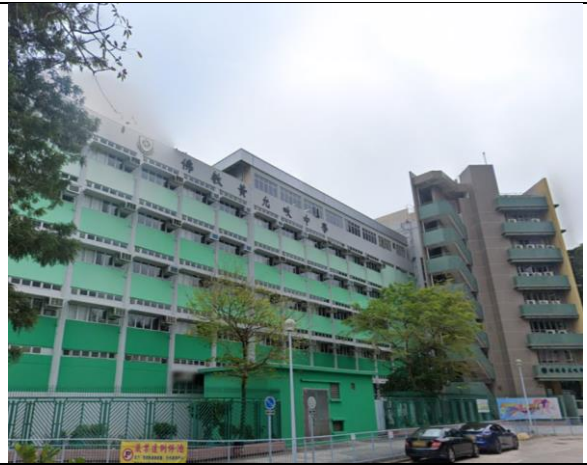
Plate 14 – NAP12: Buddhist Wong Wan Tin College