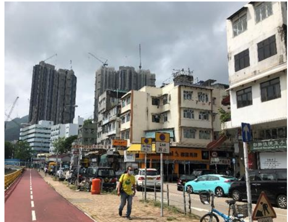
Plate 16 – NAP14: Lin Fung House