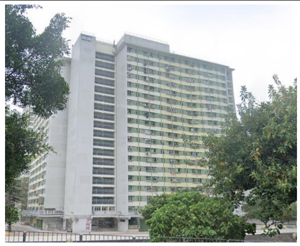
Plate 10 – NAP9a: Mei Yeung House, Mei Lam Estate (North Facade)