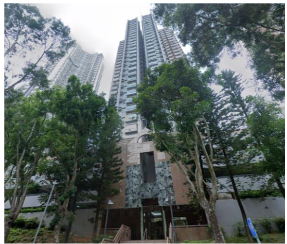
Plate 6 – NAP5: Block 2, Park View Garden