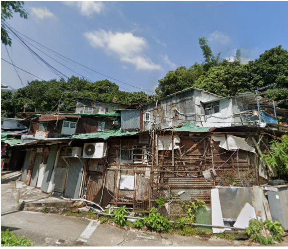
Plate 1 – NAP1: Temporary Accommodations