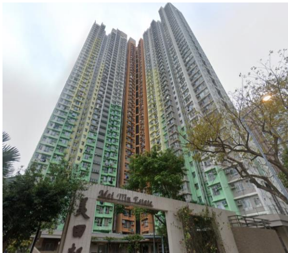
Plate 3 – NAP2b: Mei Chuen House, Mei Tin Estate