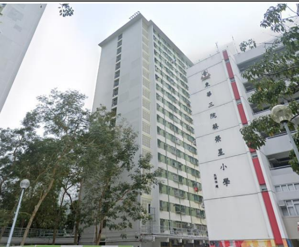
Plate 11 – NAP9b: Mei Yeung House, Mei Lam Estate (East Facade)