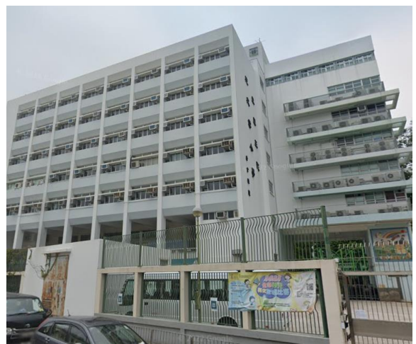
Plate 18 – NAP16: TWGHs Sin Chu Wan Primary School