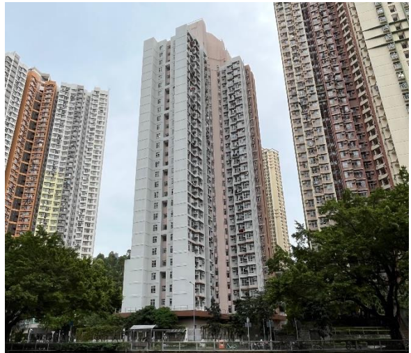
Plate 4 – NAP3: Mei Ying Court