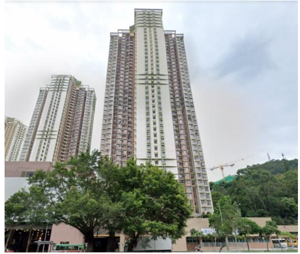
Plate 2 – NAP2a: Mei King House, Mei Tin Estate