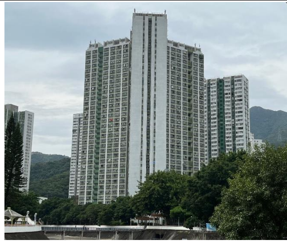
Plate 9 – NAP8: Mei Wai House