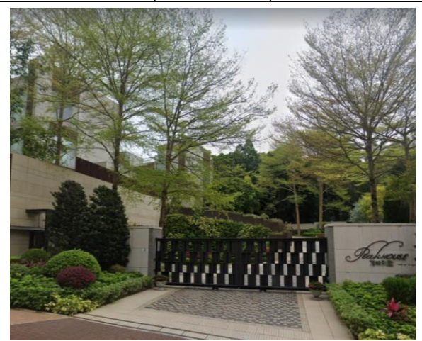
Plate 12 – NAP10: Peak House