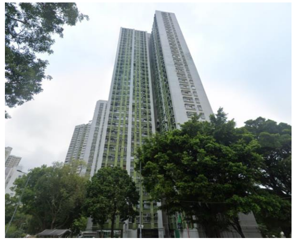
Plate 8 – NAP7: Kwai Shing House, May Shing Court