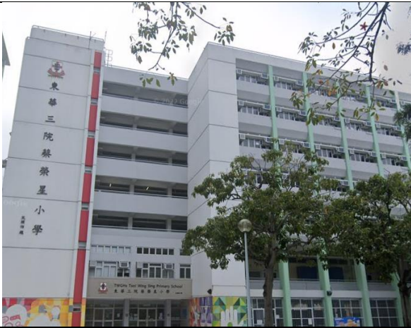
Plate 13 – NAP11: TWGHs Tsoi Wing Sing Primary School