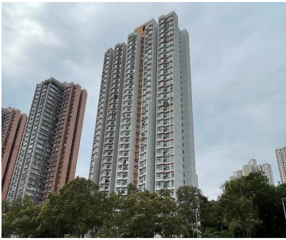
Plate 7 – NAP6: Mei Pak Court