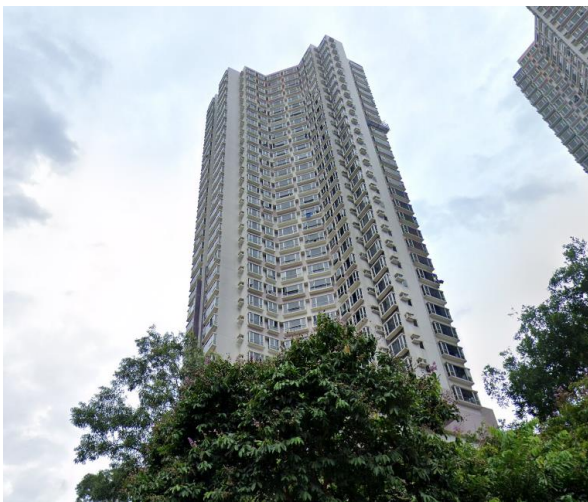
Plate 5 – NAP4: Tower 1, Granville Garden