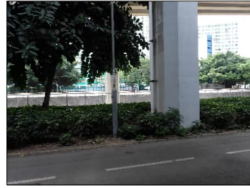
PHOTO 3467: LAMPPOST BE4332 AND CYCLING TRACK (DATE TAKEN: 31 OCTOBER 2022)