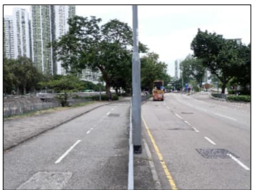
PHOTO 3495: LAMPPOST CE0608 AND CYCLING TRACK (DATE TAKEN: 31 OCTOBER 2022)