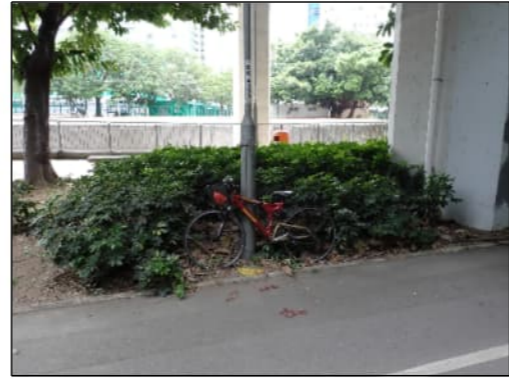
PHOTO 3469: LAMPPOST BE4333 AND CYCLING TRACK (DATE TAKEN: 31 OCTOBER 2022)