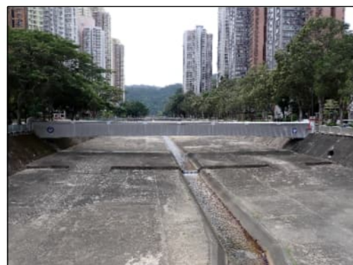
PHOTO 3492: CLP POWER CABLE BRIDGE AND TAI WAI NULLAH (DATE TAKEN: 31 OCTOBER 2022)