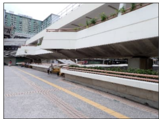
PHOTO 3489: FOOTBRIDGE AT MEI LAM ESTATE (DATE TAKEN: 31 OCTOBER 2022)