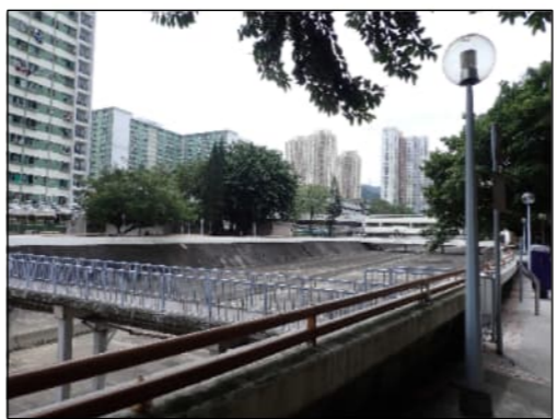
PHOTO 3488: TAI WAI NULLAH AND FOOTBRIDGES (DATE TAKEN: 31 OCTOBER 2022)