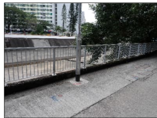
PHOTO 3472: LAMPPOST EA5356 AND FOOTPATH (DATE TAKEN: 31 OCTOBER 2022)