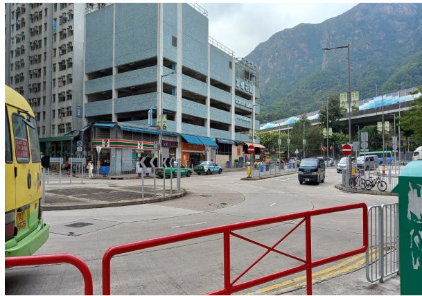
Photo 5: Vehicle access road to Lung Mun Oasis and Glorious Garden is located at the South of the LFRSR NB & LFRSR SB Project sites.