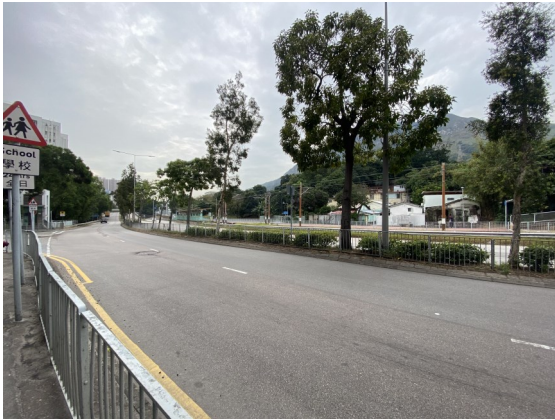
Photo 1: Tsing Wun Road is located at the North of the LFRSR NB & LFRSR SB Project sites.