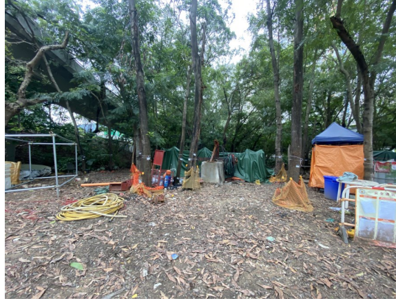
Photo 8: DSD's Works Area within LFRSR NB & LFRSR SB Project sites.