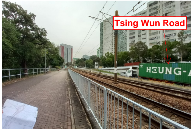
Photo 2: Tsing Wun Road comprises the Light Rail railway, vehicle roads and pedestrian access.