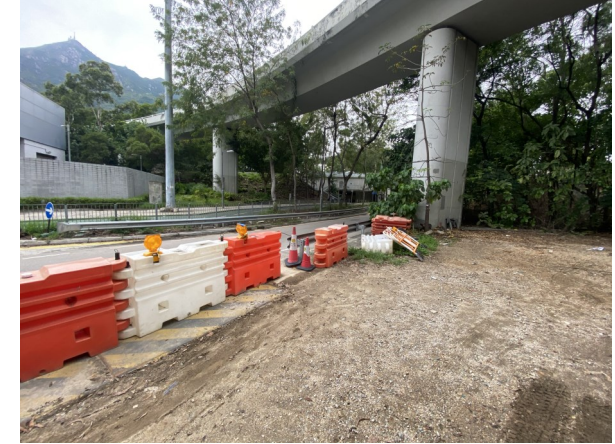
Photo 9: Vacant land near the DSD's Works Area, within LFRSR NB & LFRSR SB Project sites.