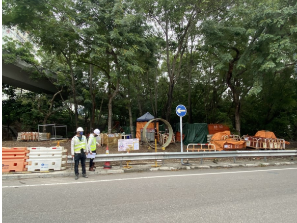
Photo 7: DSD's Works Area within LFRSR NB & LFRSR SB Project sites.