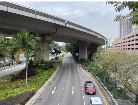
Photo 4: Lung Mun Road, Tsing Wun Road and Elevated Lung Fu Road are located at the South of the LFRSR NB & LFRSR SB Project sites.