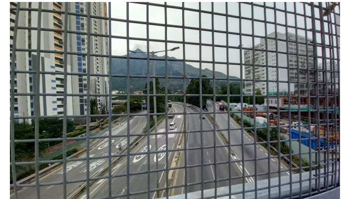
Photo 6: Wong Chu Road, elevated Lung Fu Road and Lung Mun Road are located at the East of the LFRSR NB & LFRSR SB Project sites.

PROJECT: TRAFFIC IMPROVEMENT SCHEME IN TUEN MUN - WIDENING AND ADDITION OF SLIP ROADS AT LUNG FU ROAD/ TUEN MUN ROAD/WONG CHU ROAD/HOI WING ROAD