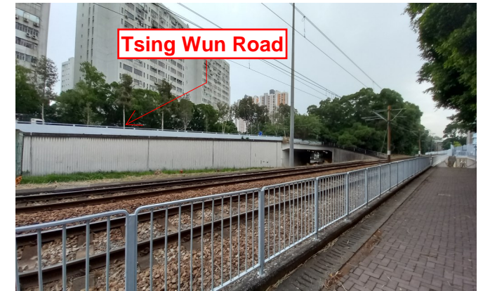
Photo 3: Tsing Wun Road comprises the Light Rail railway, vehicle roads and pedestrian access.