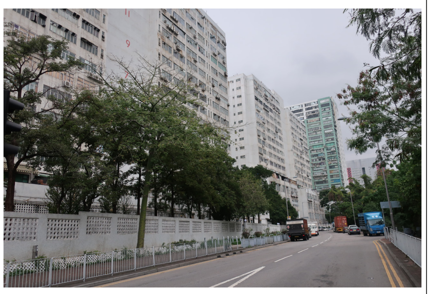
LR.8.2 - GOVERNMENT BUILDING