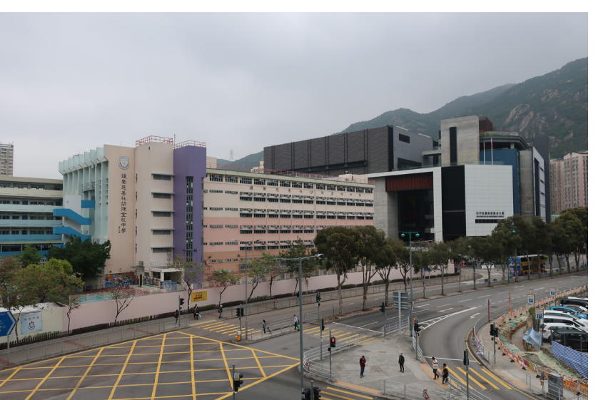
LR.8.1 - ELDERLY HOME