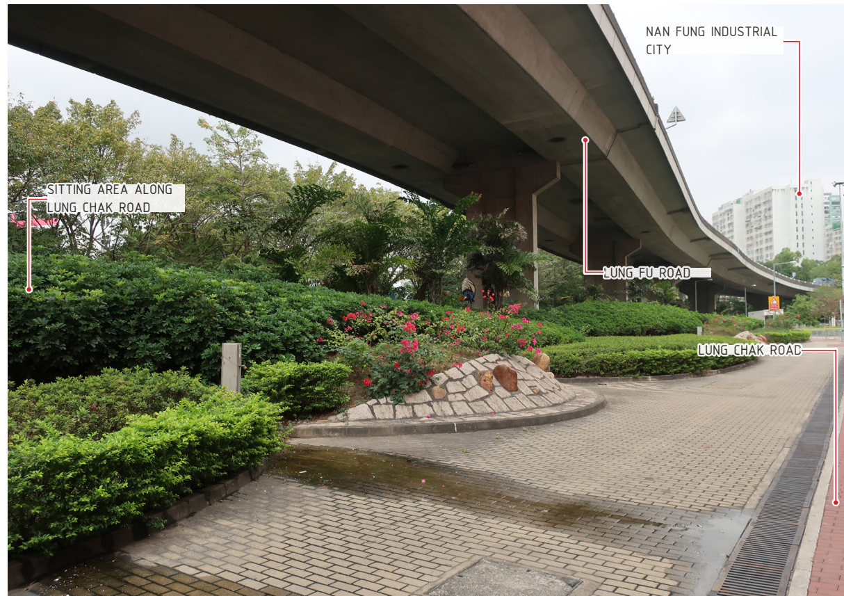
VP03 – SITTING AREA ON LUNG CHAK ROAD - EXISTING SITE CONDITION