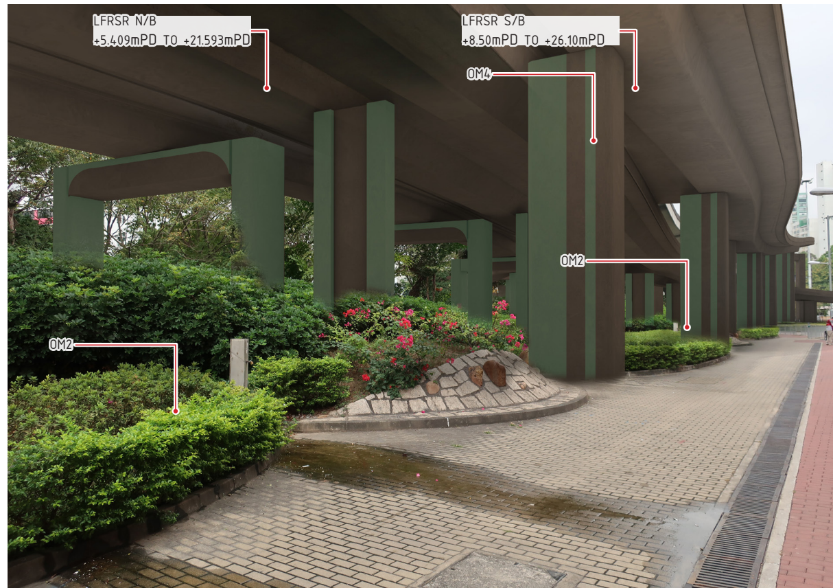
VP03 – SITTING AREA ON LUNG CHAK ROAD - DAY 1 WITH MITIGATION MEASURES