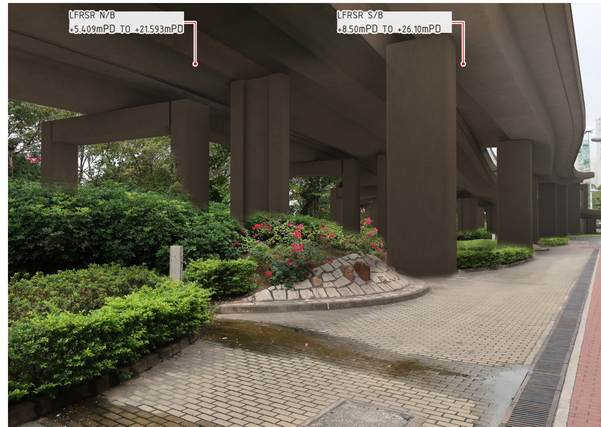
VP03 – SITTING AREA ON LUNG CHAK ROAD - WITHOUT MITIGATION MEASURES