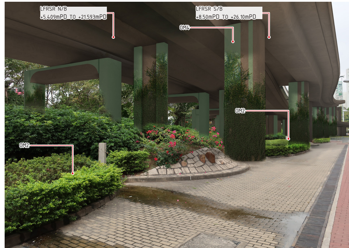
VP03 – SITTING AREA ON LUNG CHAK ROAD - YEAR 10 WITH MITIGATION MEASURES